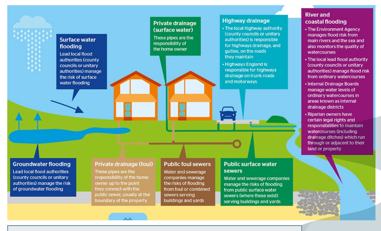
Figure 2: Diagram of possible contributing factors to flooding, and who would be responsible.

The FRM team do not have an emergency response role during a flood event. If you are in a dangerous or life-threatening situation during a flood event, you should call the emergency services and not the FRM team. However, the FRM team does gather data to inform our post-flooding investigations and improve our understanding of flood risk in the county. This means that when you are in a safe position to do so, you can contact the FRM Team to inform us of any flooding you may have experienced. Further details on how to contact the team can be found within this booklet, however our online flood reporting tool can be accessed here: <a href="https://www.warwickshire.gov.uk/flooding">www.warwickshire.gov.uk/flooding</a>