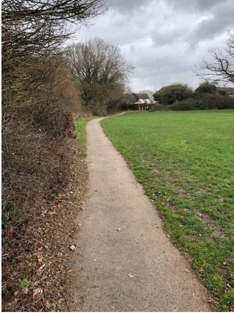
Figure 1 – Alcester Parish Council Jubilee Walk Footpath