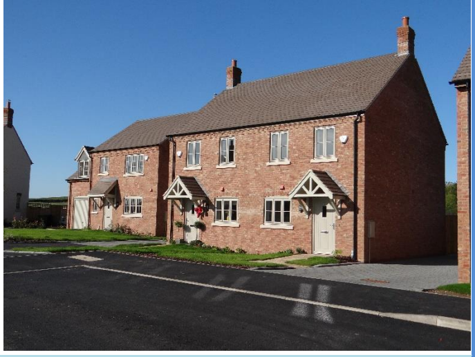
Local market houses