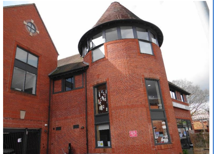
View from Guild Street