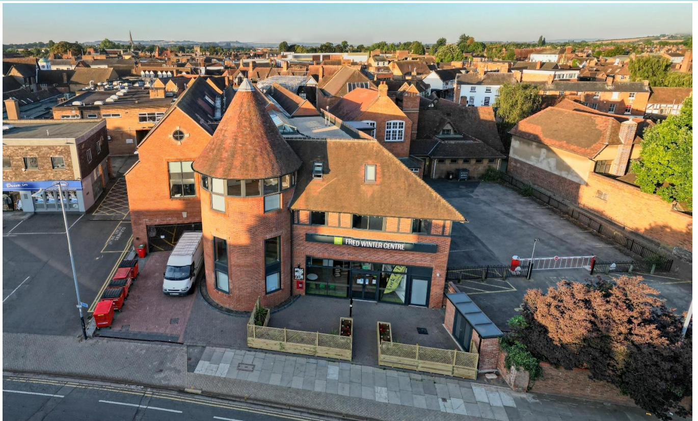
Aerial view