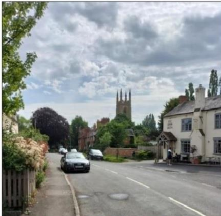
Hampton Lucy Church, The Boars Head and Conservation Area in Church Street