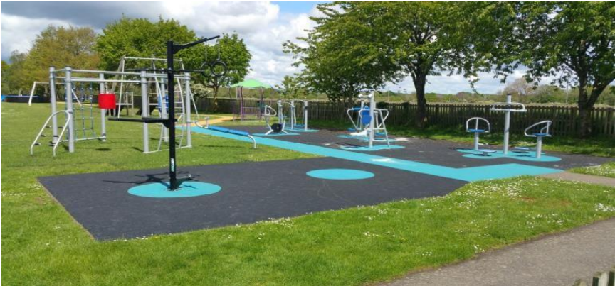
Figure 4 – Greig Hall at Alcester