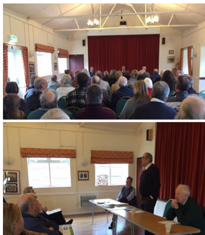
Initial Public Meeting Blackwell Village Hall 18

Following a decision by the Parish Council to promote the idea of a Neighbourhood Plan, in the spring of 2017, Parish Councillors and others organised meetings at Blackwell and Newbold-on-Stour village halls. The complex nature of the Neighbourhood Area necessitated holding meetings in two locations to make them accessible to all residents. The first meetings were held to canvass support for the idea of creating a Neighbourhood Plan and to seek volunteers to take the project forward. Given the population of the Designated Area, attendance was low, although both venues were full. The motion to proceed with the Neighbourhood Plan was carried unanimously.