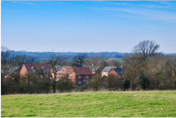
From SM9 Grid ref: 419655