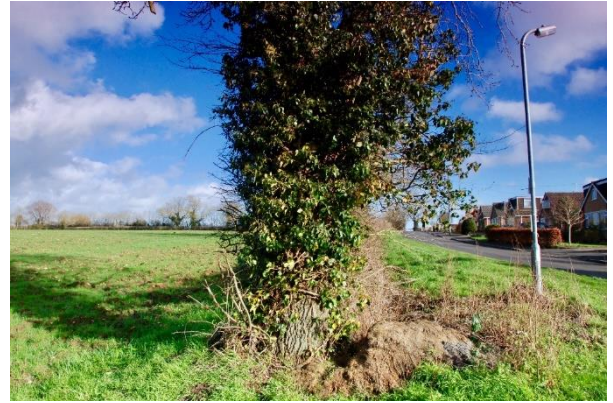
From Collingham lane Grid ref: 419651

Notes – Were designated as “4” in original document