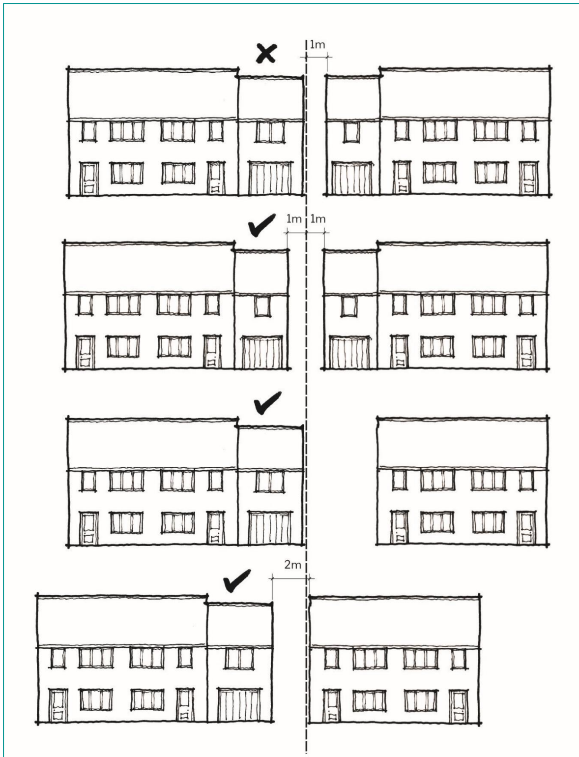
Fig.2 - shows side extensions designed to avoid the 'terracing effect'.

Further information in respect of design can be found in Part C & D of the Council's Development Requirements Supplementary Planning Document.