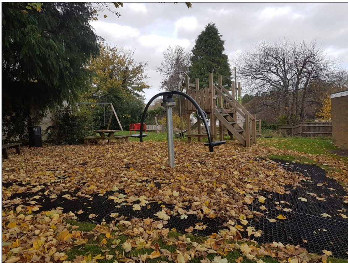
Figure 2 – Lighthorne Parish Council spend on Play Equipment