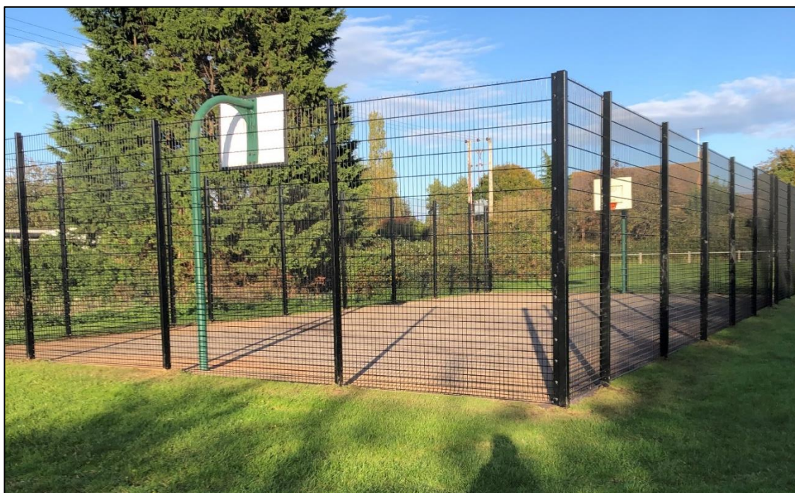
Figure 4 – Bidford-on-Avon Parish Council spend on a new fence around basketball court, Kings Lane.