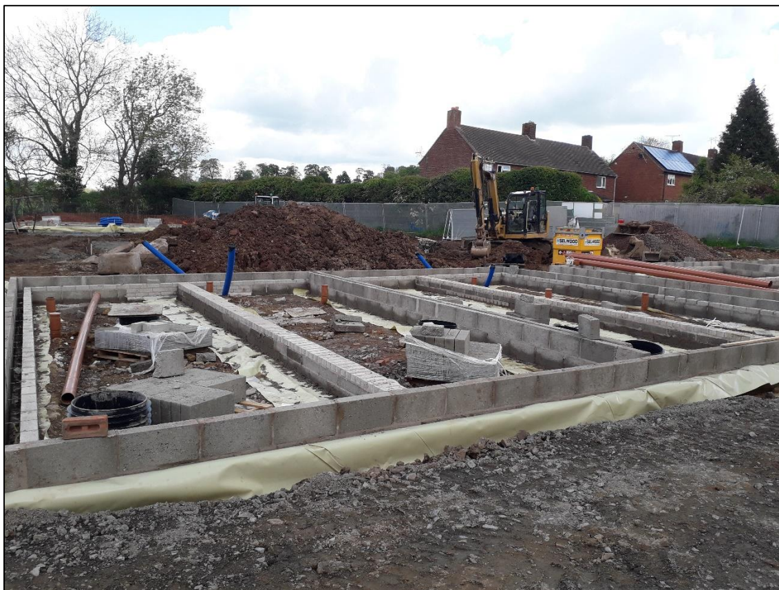
Figure 1- Bearley Affordable Housing Scheme, progress so far