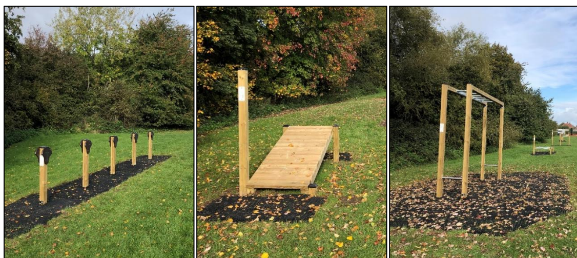
Figure 3 – Bidford-on-Avon Parish Council Spend on the Trim Trail, Kings Lane,