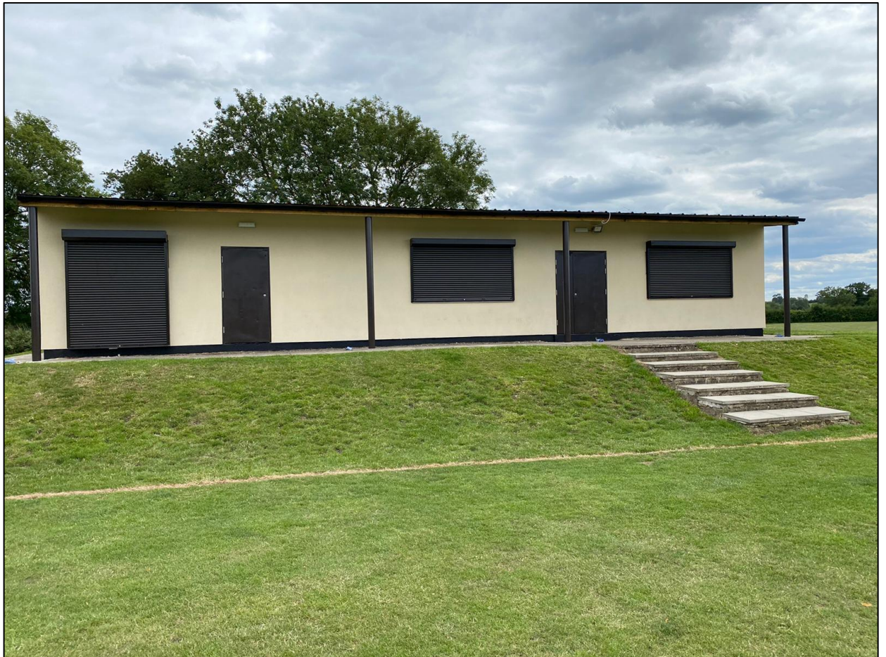
Figure 2 - Bidford Sports Pavilion