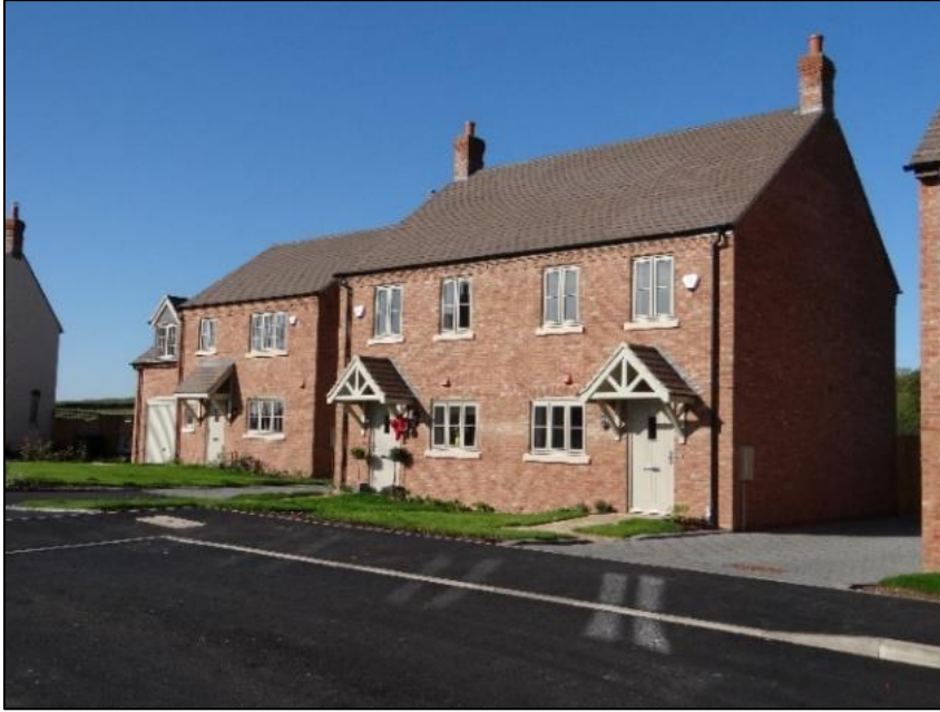
Figure 1- Sernal Lane, Great Alne