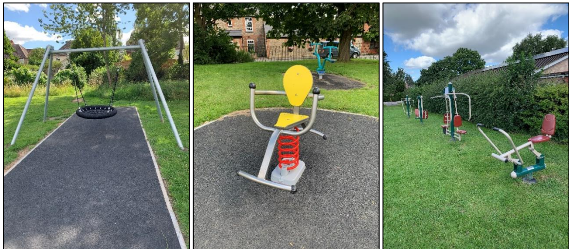
Figure 4 - Harbury Play equipment and outdoor gym