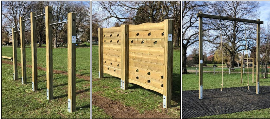
Figure 3 - Trim Trail, Big Meadow, Bidford-on-Avon