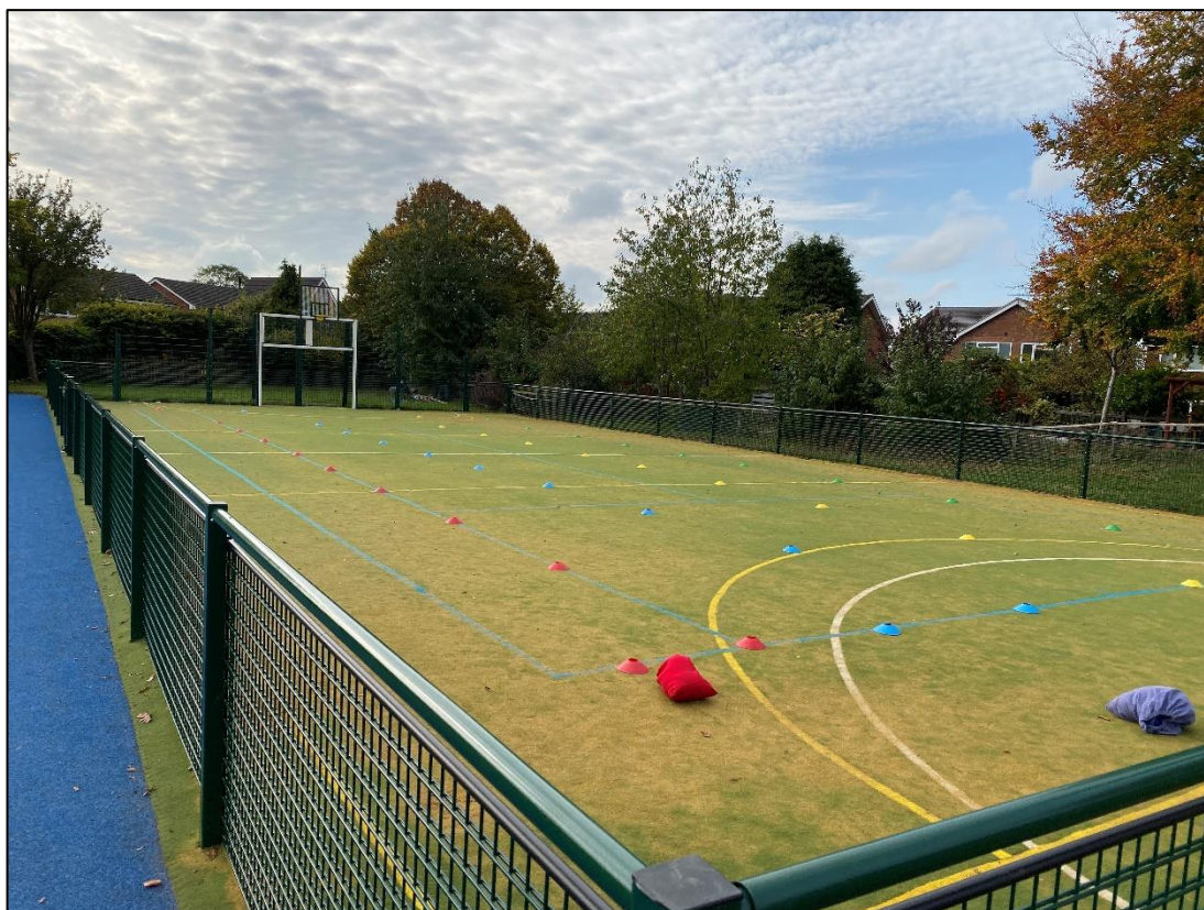
Figure 6 - Bridgetown Primary School Multi-sports surface