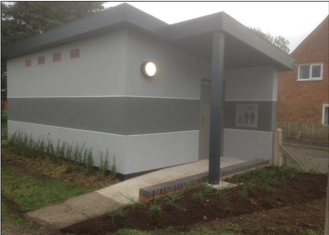
Figure 5 - Long Itchington Public Toilets