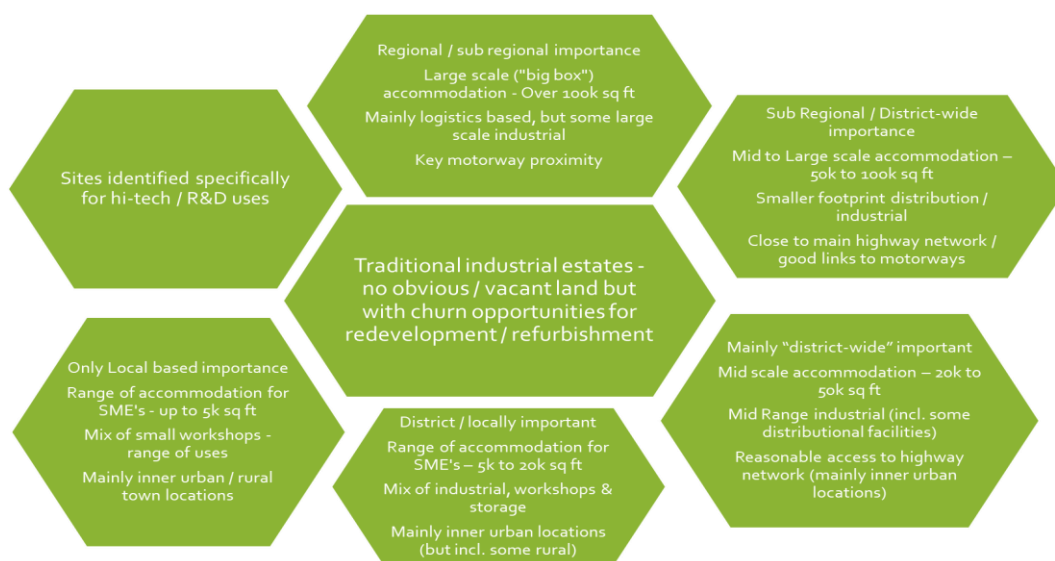
Figure 1.2 Site categories – Workspace, Industrial and Distribution

1.25 Overall it seems that additional employment land areas will need to be identified over the next 10 year period, to ensure that demand levels are met. To assist with this the categorisation set out in Figure 1.3 below, is considered a useful means of planning appropriate allocations going forward.