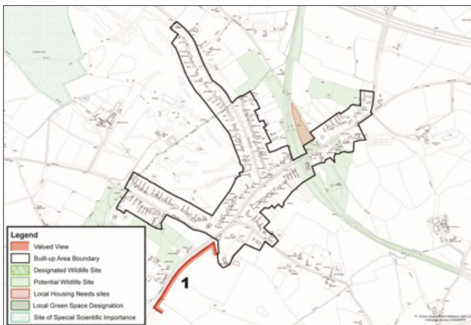
Wood End - Inset Proposals Map