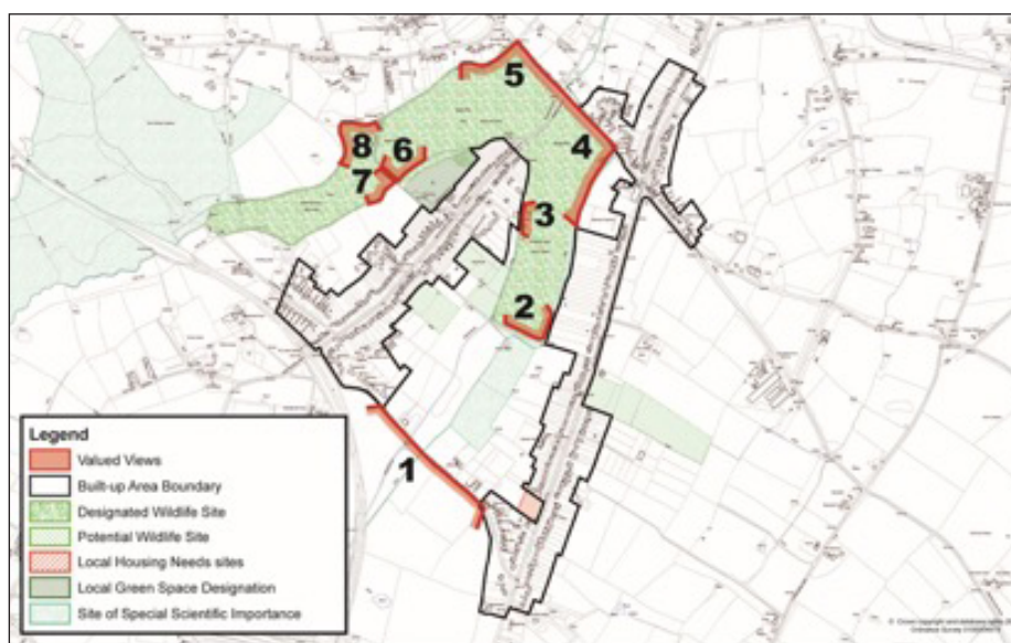
Earlswood - Inset Proposals Map

1.19. The Inset Proposals Maps below show the application of the key NDP policies to Earlswood, Tanworth and Wood End particularly in respect of the proposed opportunities for, and constraints on future development.