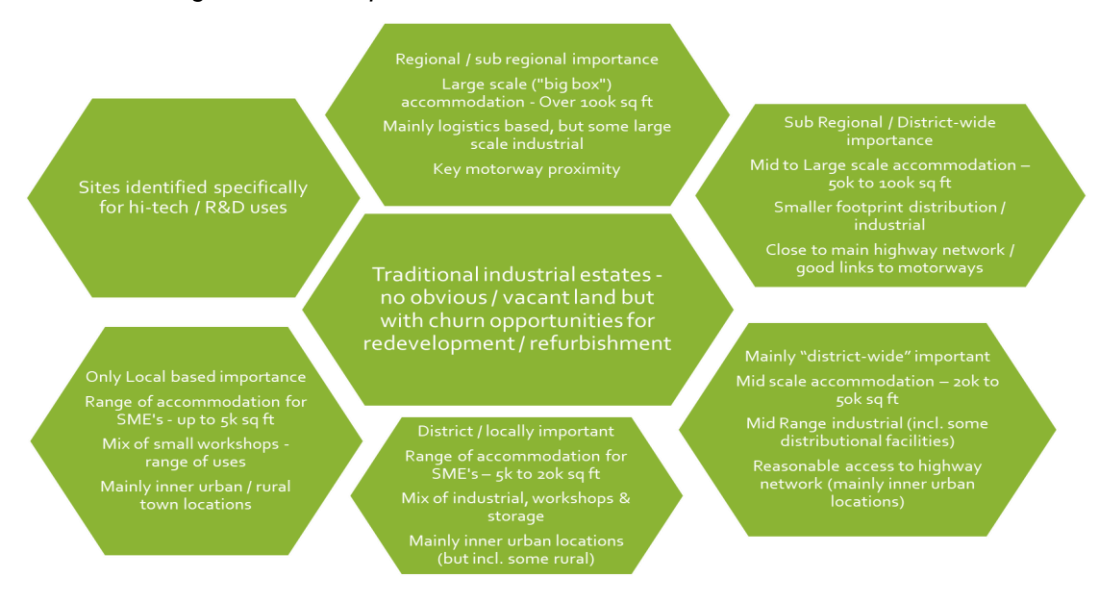
Figure 1.2 Site categories – Workspace, Industrial and Distribution

1.25 Overall it seems that additional employment land areas will need to be identified over the next 10 year period, to ensure that demand levels are met. To assist with this the categorisation set out in Figure 1.3 below, is considered a useful means of planning appropriate allocations going forward.