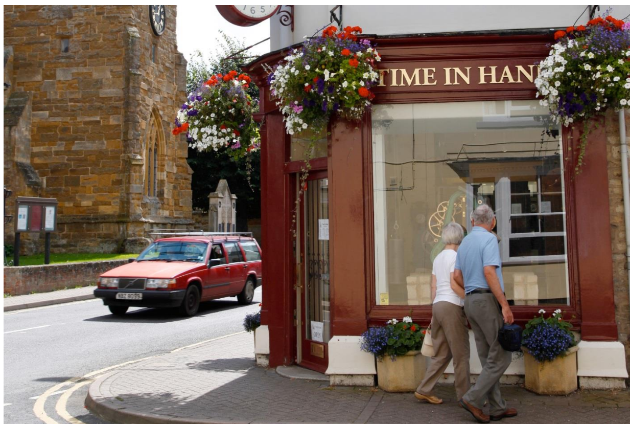
Fig.H4 – Traditional shopfront and signage in Shipston-on-Stour.

Fascias or signs should not run continuously across two or more adjacent buildings.