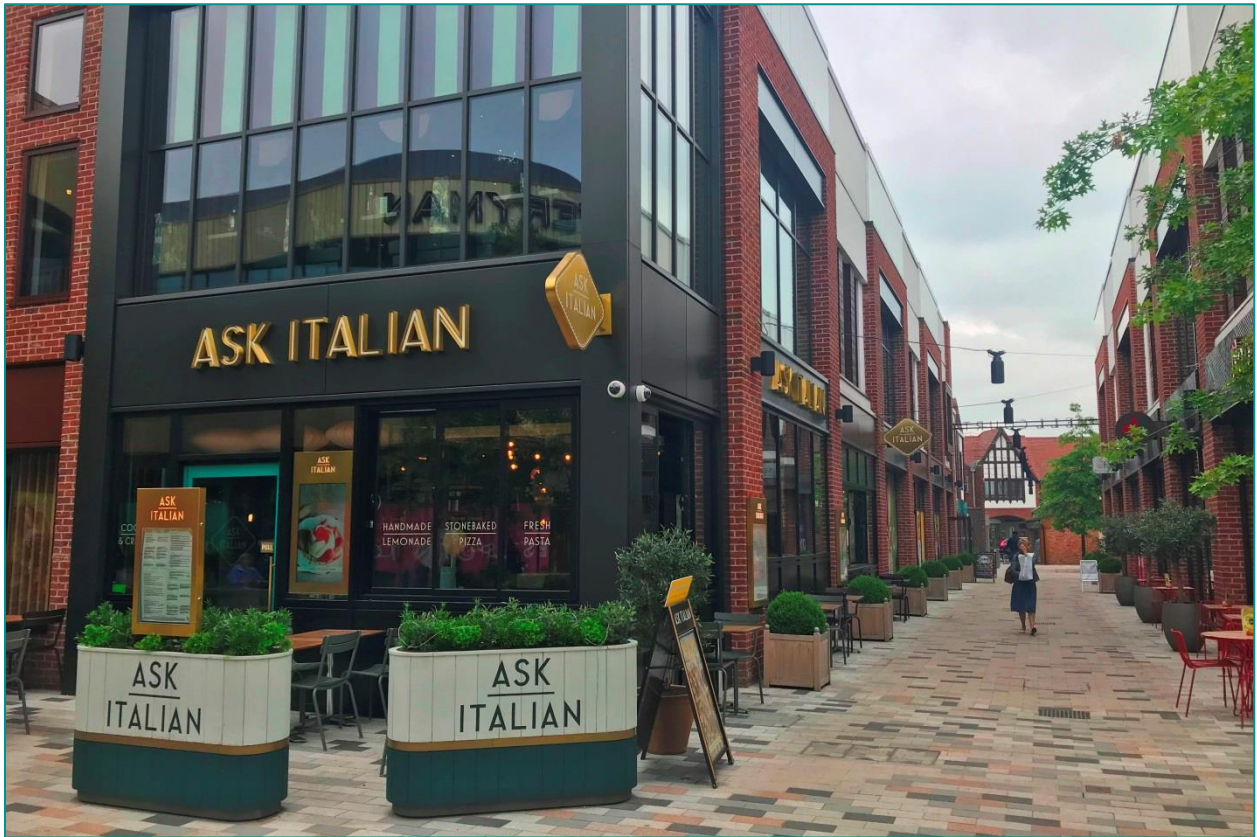
Fig H2. shows a well-designed modern shopfront.

It should be remembered that the shopfront creates a solid visual base to the building above and therefore total removal of a shopfront to open up the frontage will be unacceptable.