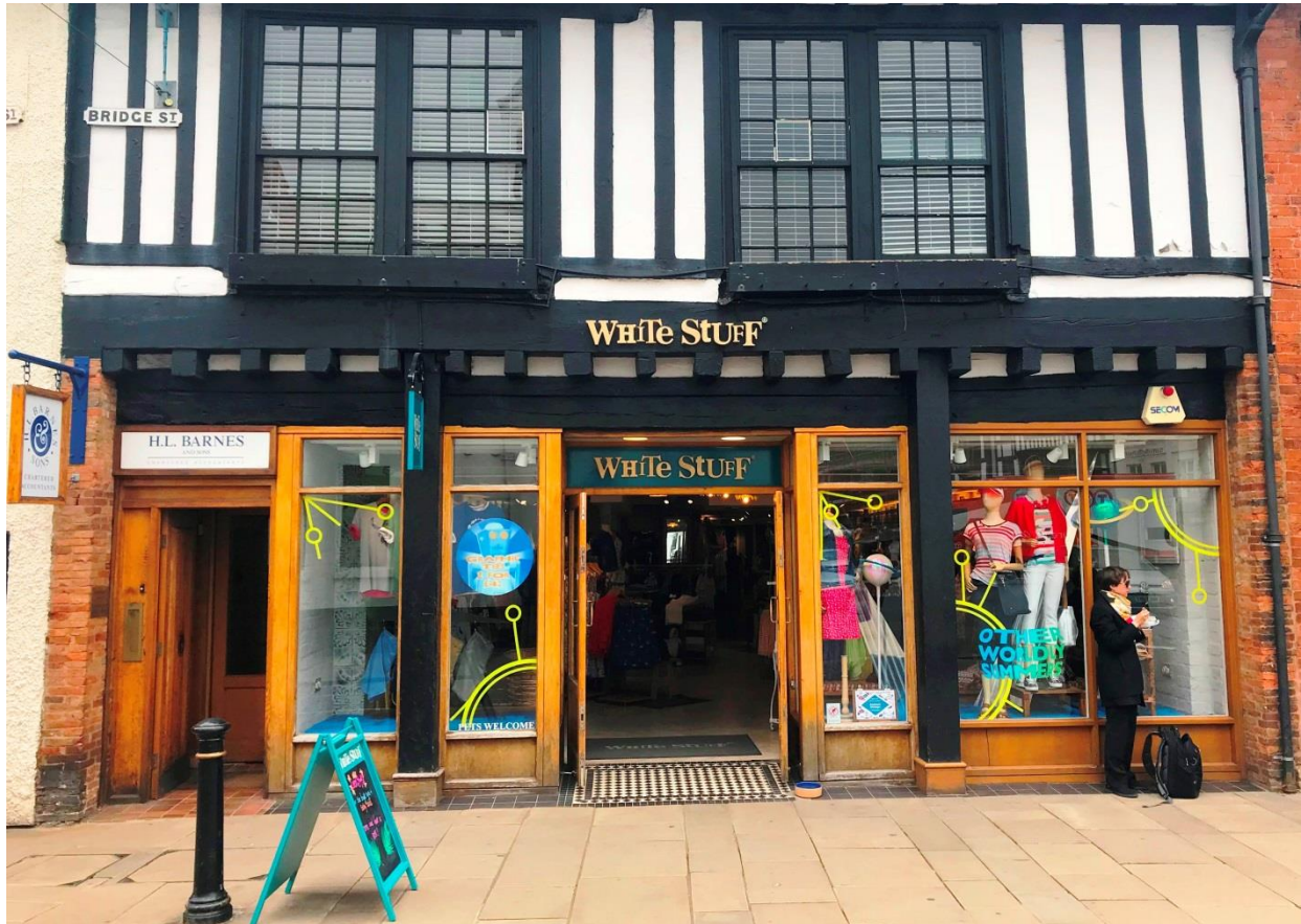
Fig.H1 - A good example of traditional shopfront design in Stratford-upon-Avon.

If, for example, the building is symmetrical, the design of the shopfront should maintain the overall symmetry. If the building is in a Classical or Georgian style, for example, some of the characteristic features that define the style should be carried forward into the new design such as proportions of openings, patterns of glazing or moulding profiles.