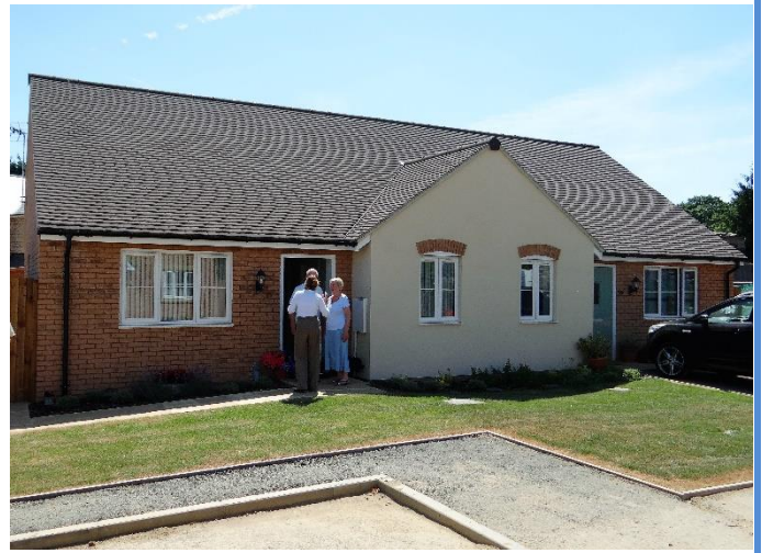
Pair of bungalows