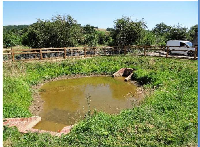
Drainage attenuation pond