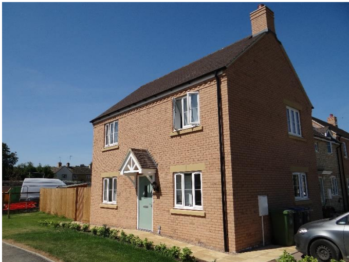
3 bedroom house