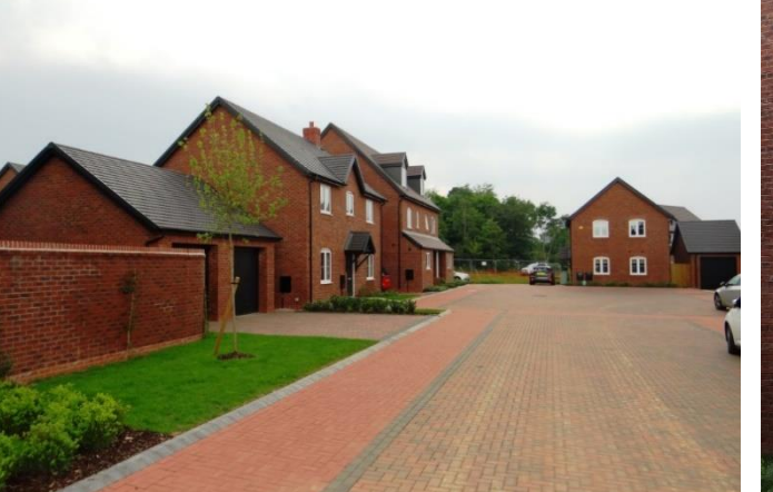
Typical street scene, Hawkins Way (semi-detached pair of 4 bed houses to left)