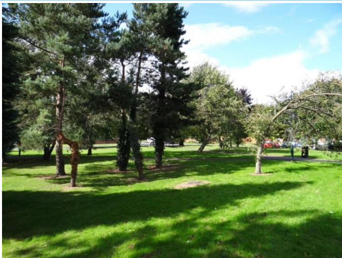
Context – adjacent public open space