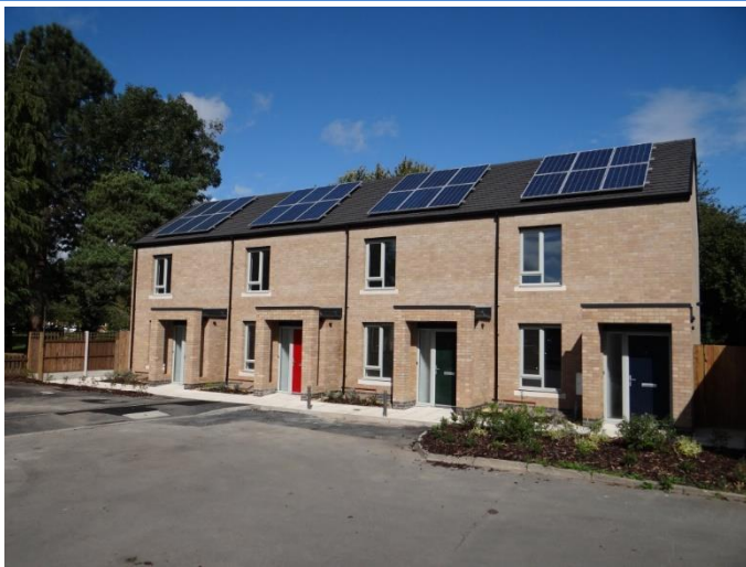
Terrace of town houses