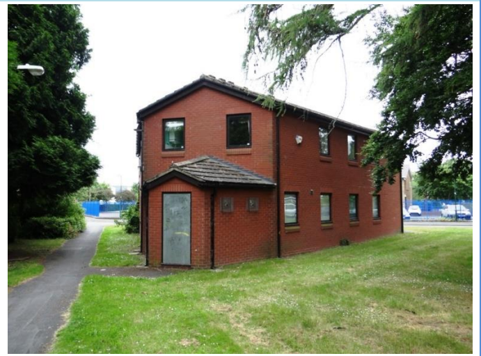
Site prior to redevelopment