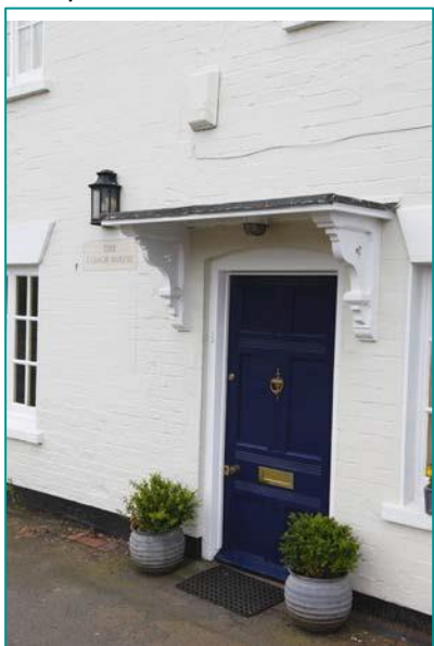
Fig. E21 - A flat canopy on brackets.

Canopies and porches are not characteristic of many of the building types in the District though in many cases they have been added. Care should therefore be taken in applying them to new designs. One of the most common types of canopy is a simple double pitch or lean-to roof on brackets. Less commonly the canopy is supported on posts. Another common type is a flat, moulded projection on brackets. Cheek walls and fully enclosed porches are rarely found and should be avoided as should hipped roofs. Porch roofs should not normally be linked to bay windows or projecting garage roofs as this is not a traditional design feature in most areas of the District. Porch roofs should, where tiled, have small sized tiles. GRP tile effect on porch roofs and windows are not acceptable.