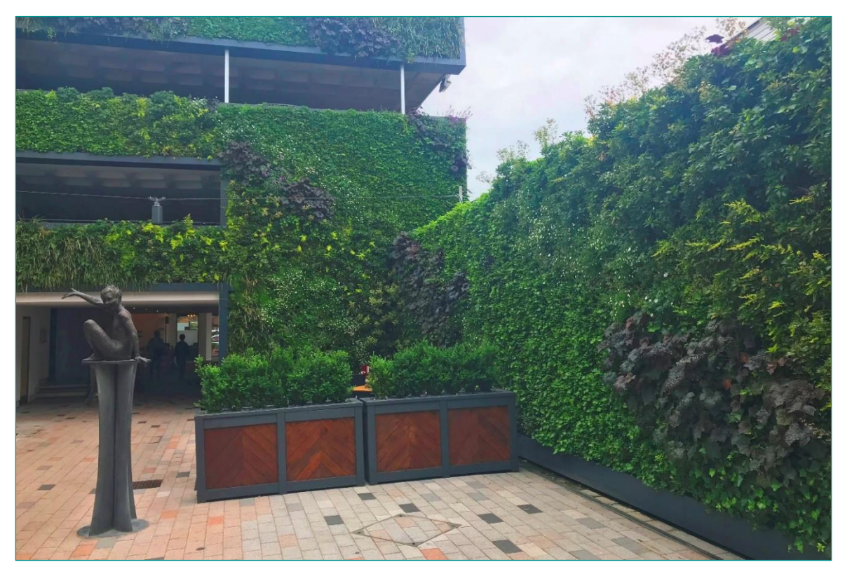
Fig. E26 - Living/Green Wall in Bell Court Stratford-upon-Avon.

While simple green walls using climbing plants have been widely used for centuries, more extensive green wall systems are developing all the time. Innovative systems now available include walls constructed from trays of plants that have been pre-grown off-site and slotted together on a steel frame, then connected up to an internal irrigation system.