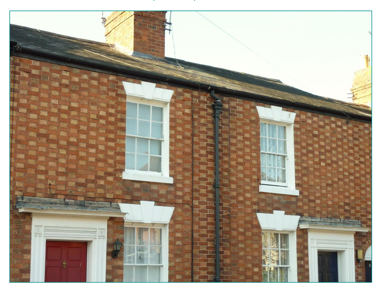
Fig. E6 - Brick (with Flemish Bond pattern using buff brick for the 'header' and orange for the 'stretcher')