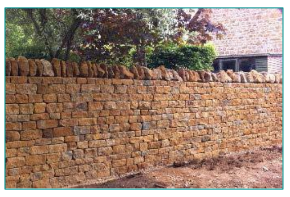
Fig. E4 – An example of Blue Lias (left).