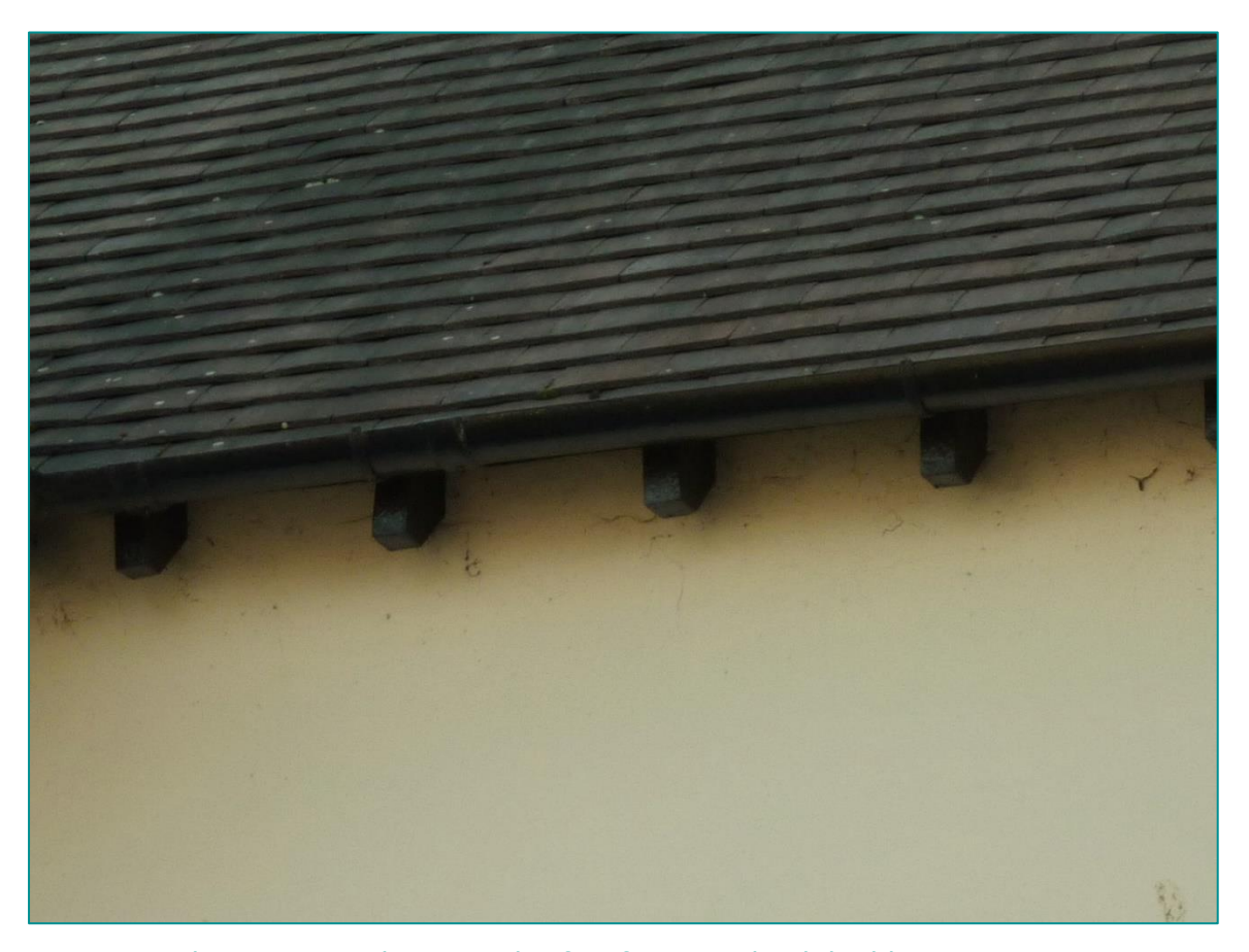
Fig. E18 – Plain eaves with exposed rafter feet on a brick building.