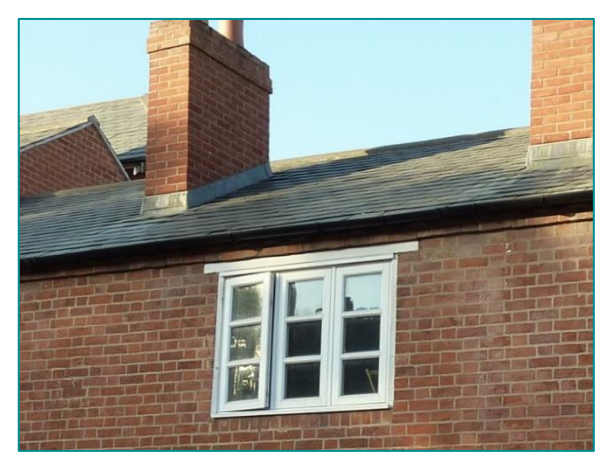
Fig. E11 - Cottages with windows set just below the top plate in Old Town, Stratford-upon- Avon. The casement windows shown are flush closing as opposed to 'storm proof'.