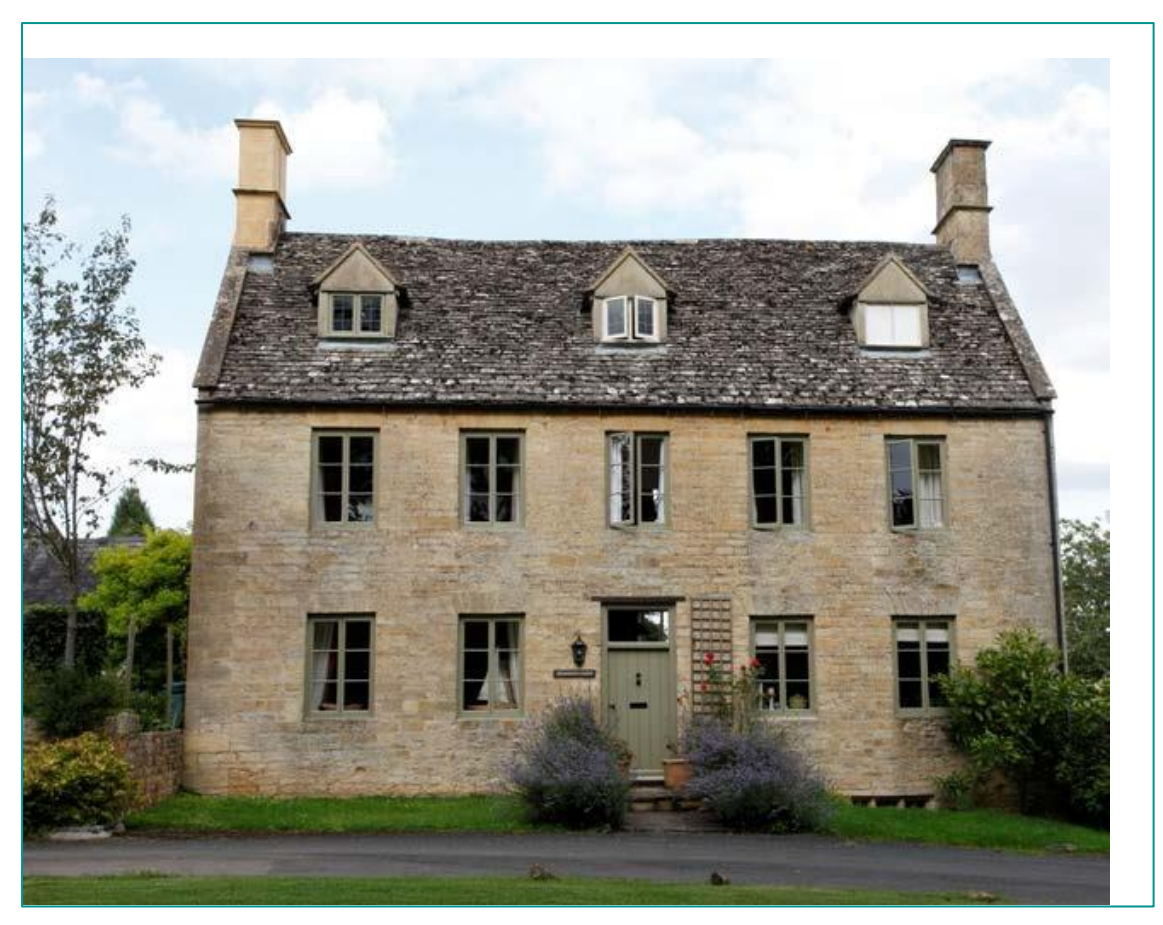
Fig E12 – A Cotswold stone house.

Cotswold and Hornton Stones are also quite variable in colour. Some Cotswold stones have high iron content and can, in colour, look similar to 'Hornton Ironstone'. There is, however, a distinct difference in the structure of the stone and therefore in the way it weathers. Cotswold Limestone is Oolitic and considerably harder. Marlstone is a Liassic stone and quite soft. Care must be taken, therefore, in the selection of stone. Most villages are predominantly one stone or the other but attention should be paid to differences within villages. While there may be one predominant wall material, in some cases there are distinct areas within villages with different predominant materials.