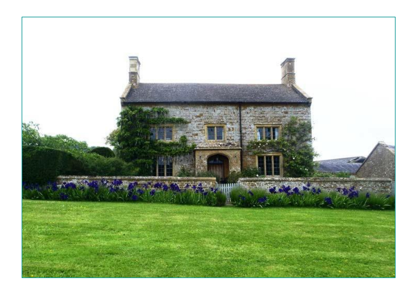
Fig. E3 - A house built in Cotswold Limestone, Compton Scorpion.

The character map of the District identifies the areas in which each construction type is commonly found. Distinct sets of details have developed for each material and, in the case of stone, for the main types of stone found in the District. Further information on the district's character areas may be found in <a href="Part A: Achieving Good Design">Part A: Achieving Good Design</a>.