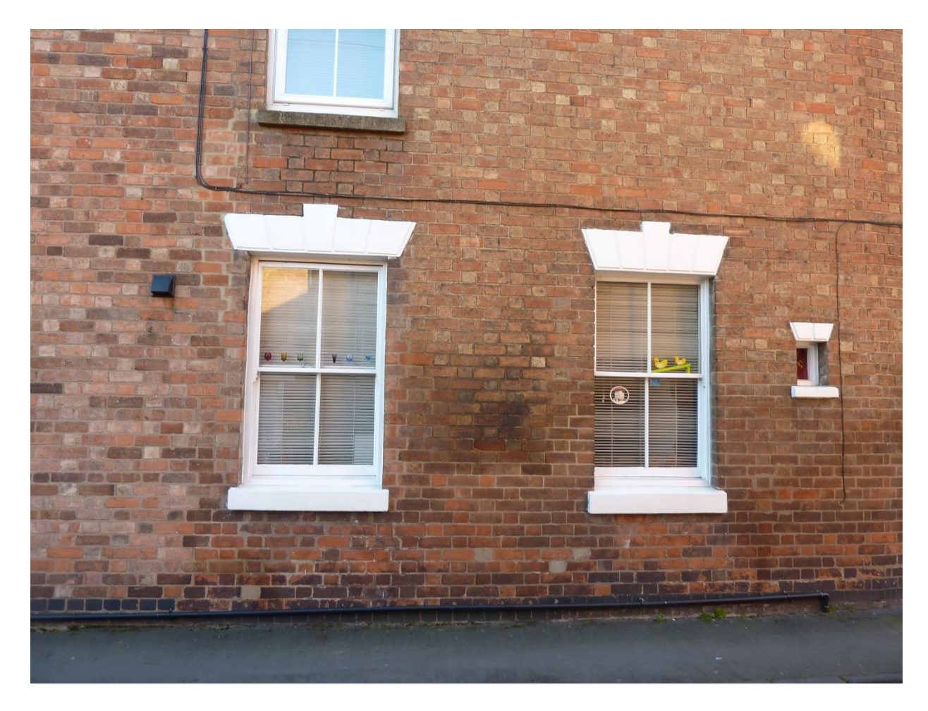
Fig. E12 – An example of windows with render used to create the effect of stone lintels. The windows have stone cills and sliding sash frames.