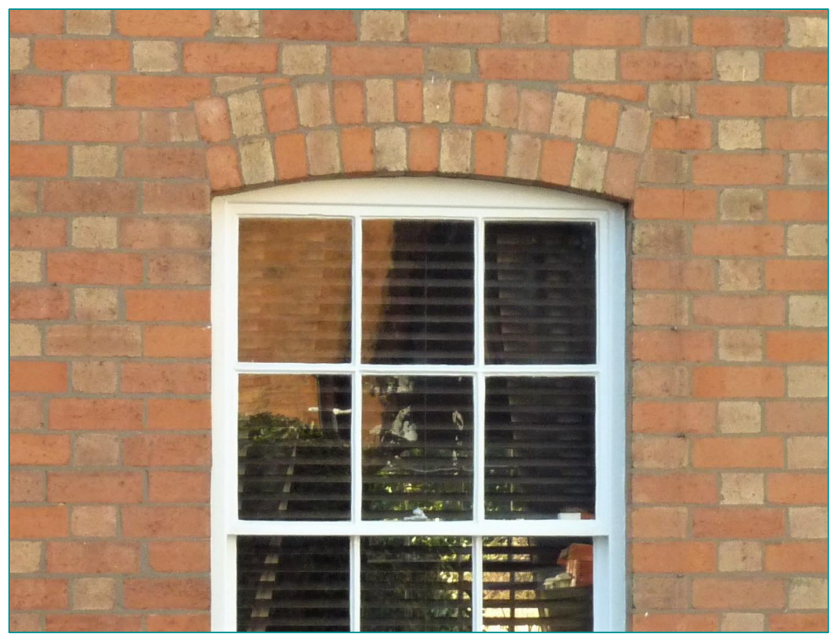
Fig E10 - Window with a segmental arch head. Note the arch is made up of headers on edge, a detail very characteristic of brick areas within the District.