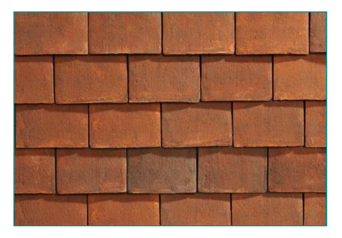
Fig. E7 - Photo of slate tile (left) Fig. E8 - Photo of plain clay tiles (right)