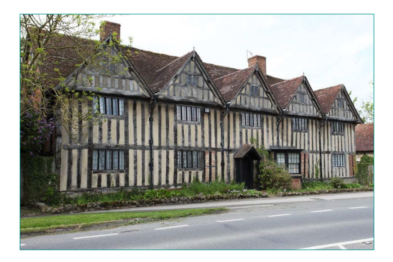
Fig. E1 - Photo of close studded timber framed house with rendered infill panels in Long Itchington, Feldon area.