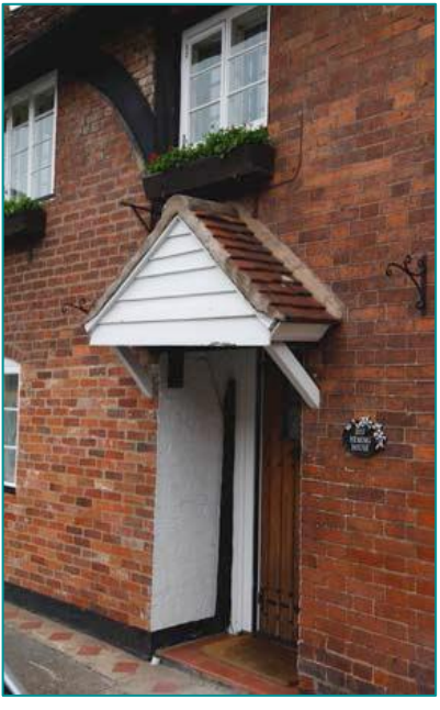
Fig. E 24 - Double pitched canopy.