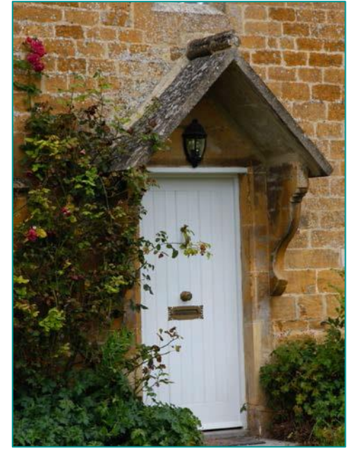
Fig. E23 - Double pitched canopy, Cotswold area.