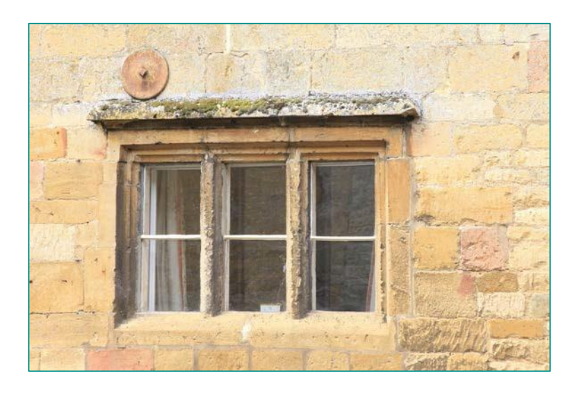
Fig. E13 - A Hornton stone farmhouse with a three light window, stone mullioned window. The window has flush head, jambs and cill with a label or hood mould above the head.

As a general rule, window and door openings must have visible means of support for the material above. The most common traditional solutions found in the District are segmental arches, flat arches or lintels in squared rubble or dressed stone as well as oak lintels.