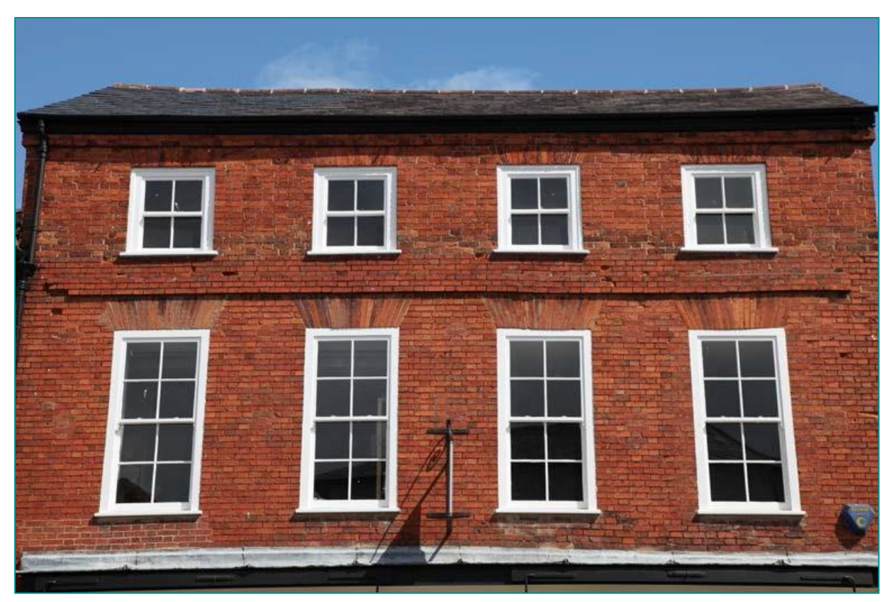
Fig. E 9 - Gauged brick flat arches on a house in Henley-in-Arden, Arden area. The openings are vertically aligned and the second floor windows are smaller than the first floor windows.