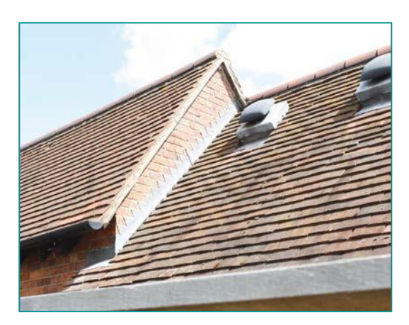
Fig. E14 - Examples of 'wet verge' using mortar to secure the roof tiles.