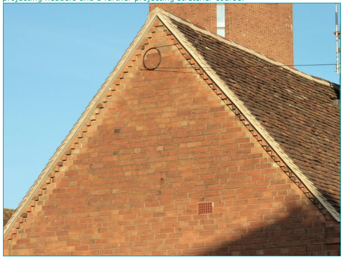
Fig. E17 – A trim verge of brick with stepped projecting header corbelling and a half-round ridge tile.