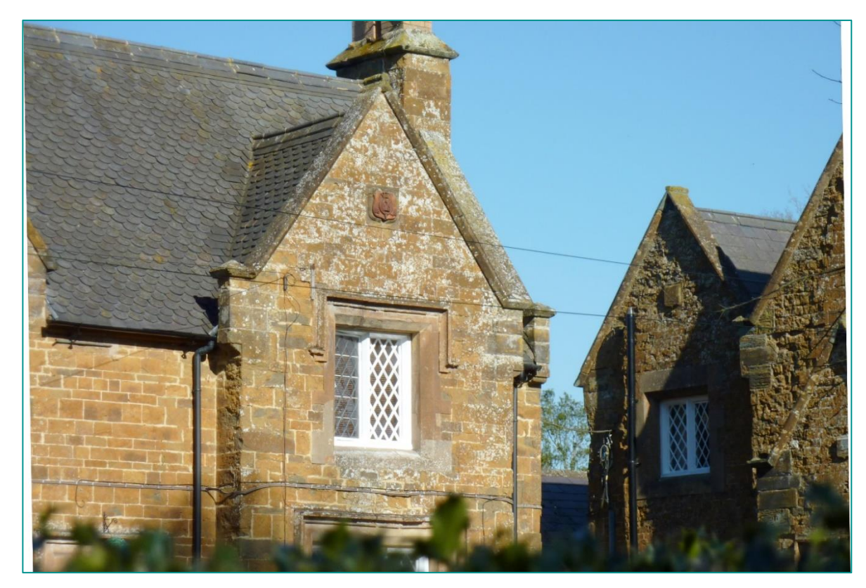
Fig. E15 - A stone–coped gable parapet of Hornton stone with a corbelled verge/eaves junction known as a kneeler.