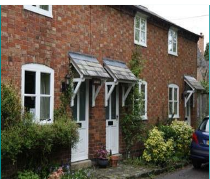
Fig. E 22 - Lean to canopies with brackets, Welford-on-Avon, Avon Valley. The roof material is inappropriate in this case as smaller roof tiles are needed.