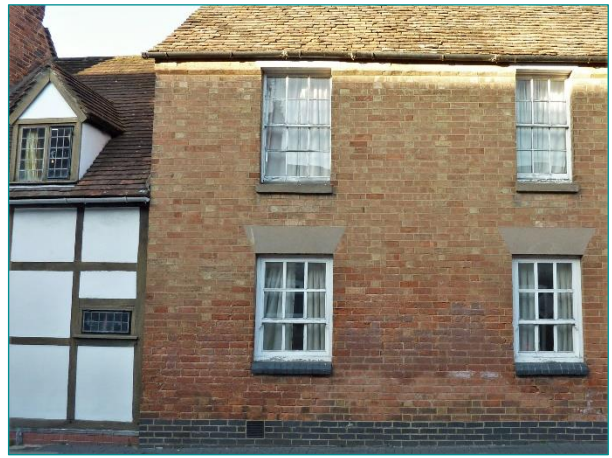
Fig. E2 - Photo of a brick house with rubbed brick flat arch window heads in Stratford on Avon.