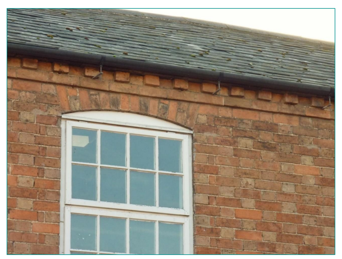
Fig. E16 – Dentilated brick eaves made up of a projecting stretcher course, alternating projecting headers and a further projecting stretcher course.