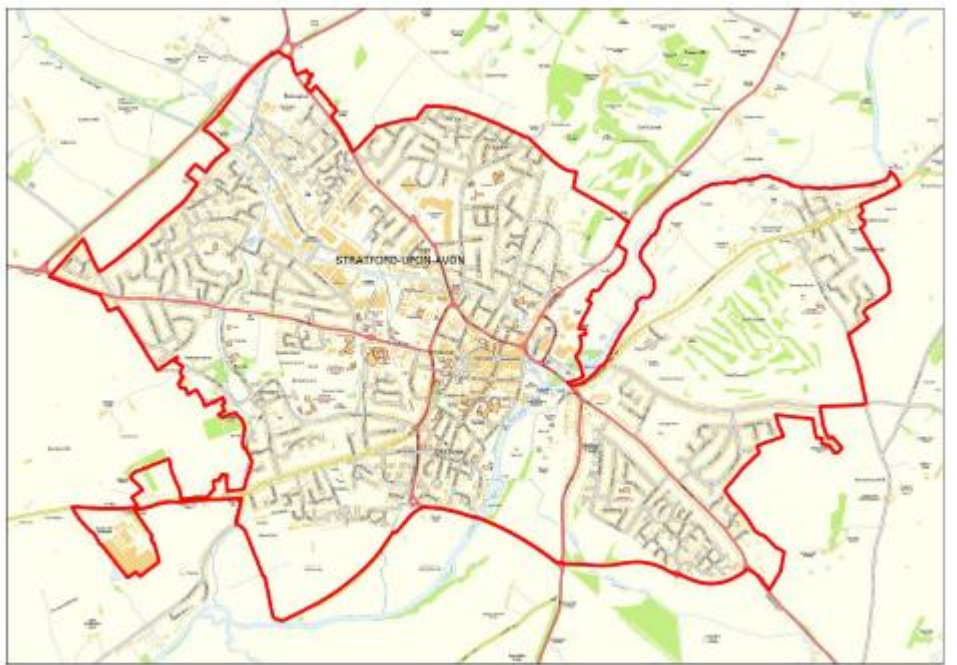
Figure 1: Stratford-on-Avon Air Quality Management Area (AQMA) boundary

Stratford-upon-Avon town is covered by an Air Quality Management Area (AQMA), shown in figure 1, which was declared in 2010 as a result of historically measured exceedances of the annual mean nitrogen dioxide objectives. No such exceedances have been measured in recent years, however continued monitoring under the Local Air Quality Action Plan is still in effect.