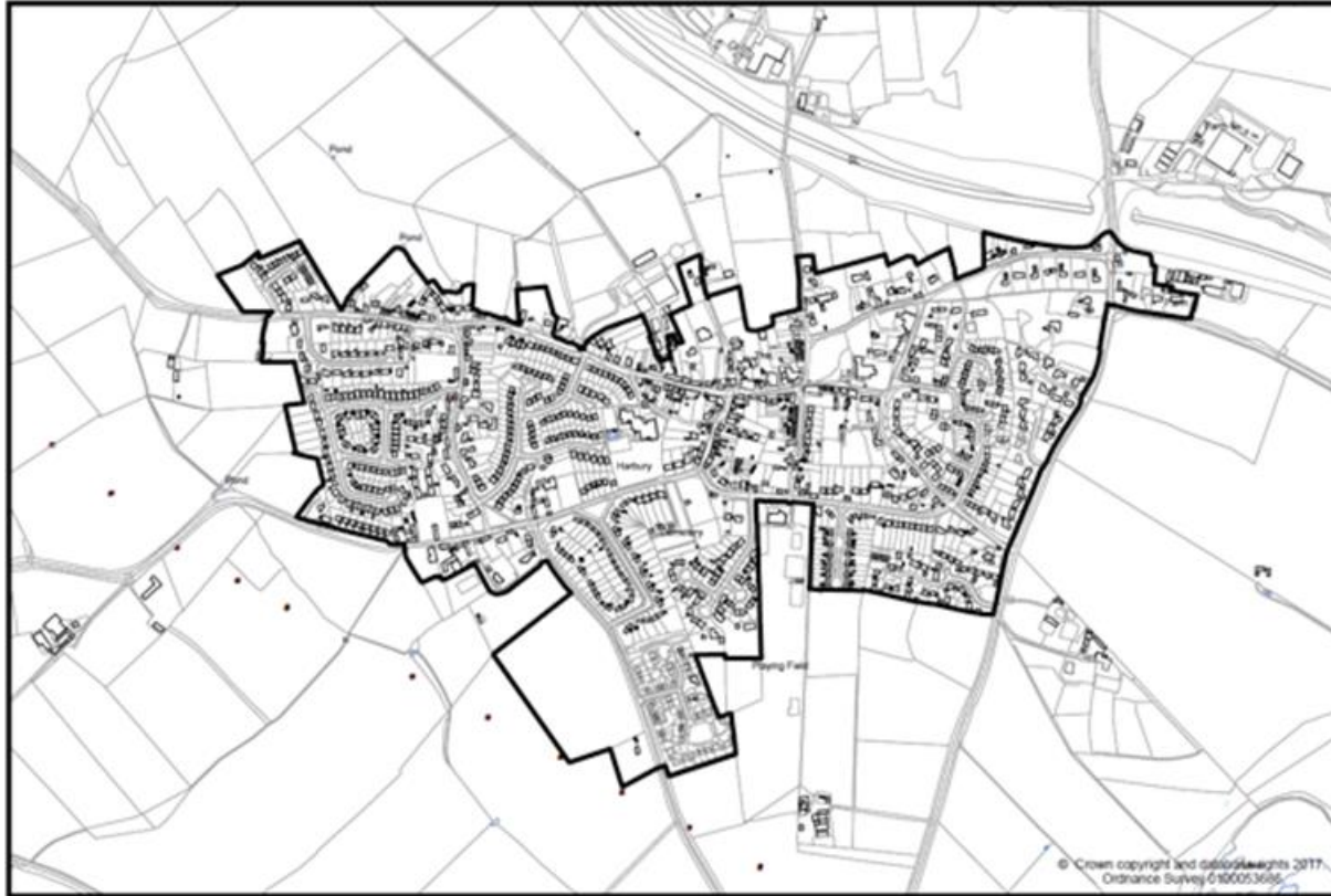
Built-up Area Boundary