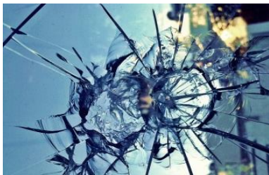
Damage to property

Some examples of anti-social behaviour are: