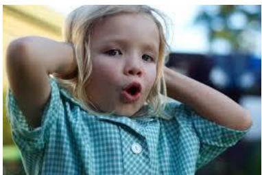
Being very noisy