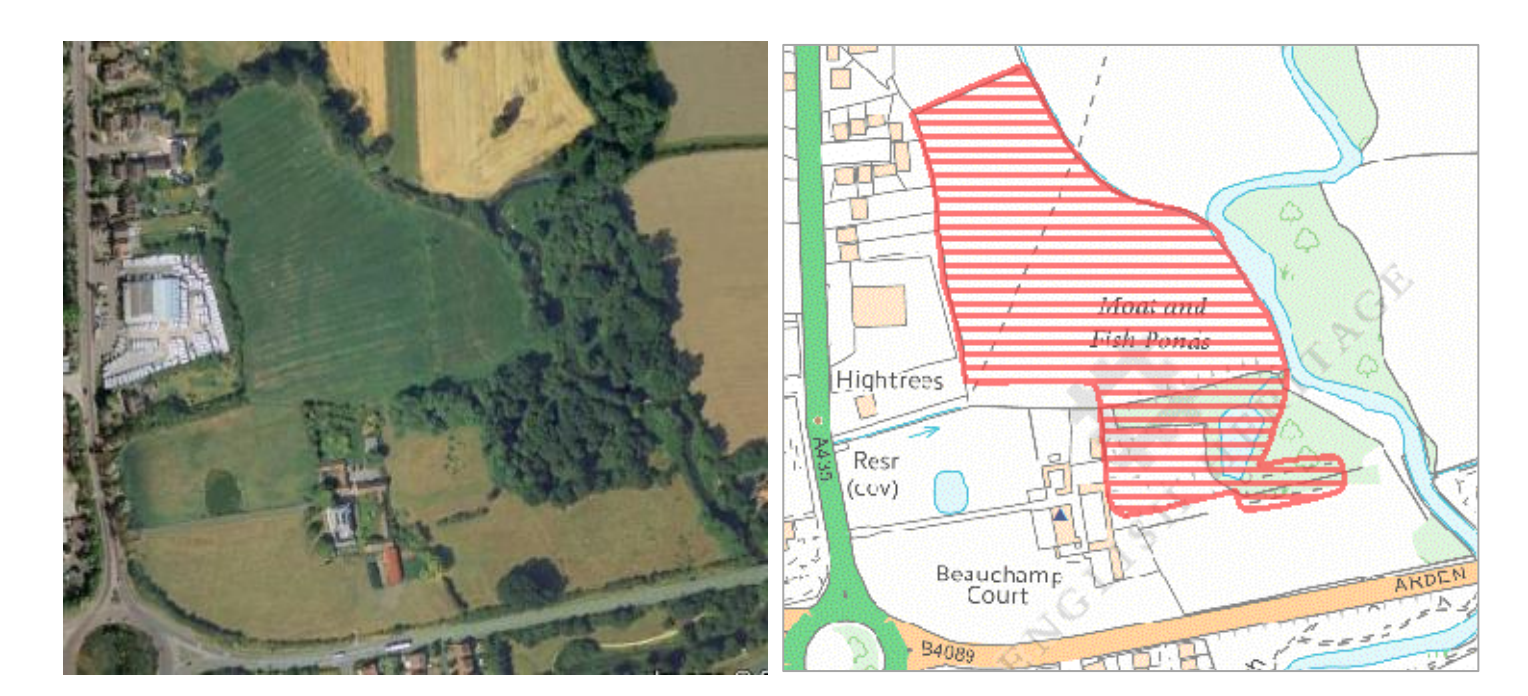
Figure 3 : The medieval settlement at Beauchamp Court showing the scheduled area in red and the listed building as a blue triangle. Beauchamp Court is an 18<sup>th</sup> century or 19<sup>th</sup> century house listed grade II on 21 June 1985. It is said to be the site of the medieval manor house of Alcester. The scheduled earthworks include the buried remains and earthworks of a moated manorial site dating to the 13<sup>th</sup> century established by Geoffrey de Beauchamp. There are associated fish ponds near the moat, which is close to the River Arrow within the area of trees visible on the satellite photograph. The northern part of the scheduled area contains ridge and furrow.

See Figure 1 for the location of this site.