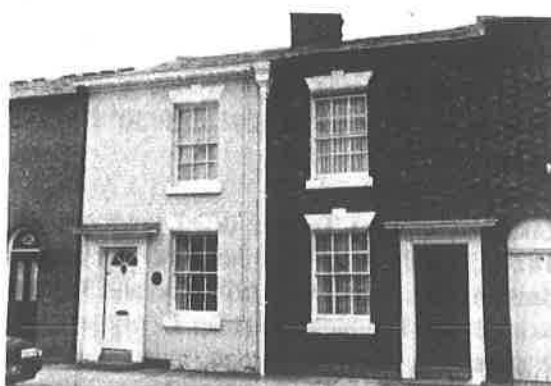
3 and 4 College Street (photo also page 41) (Ref No. 63 - Grade II)

(Bearman R: Stratford-upon-Avon: a history of its streets and buildings : Nelson: 1988:- 66).