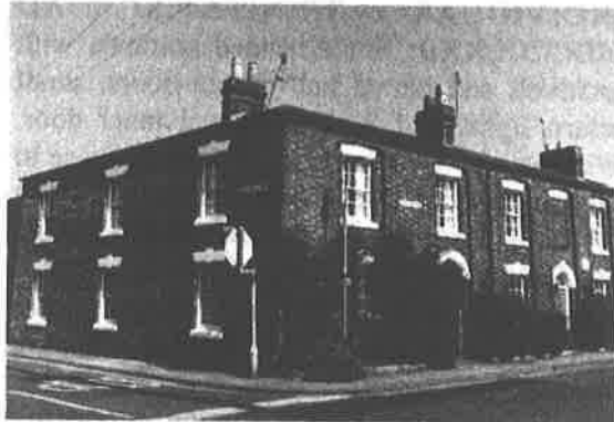
1A, 1B and 2A College Street (photo page 41) (Ref No. 62 - Grade II)

List description : Pair of town houses. 1820s. Brick with buff headers and stucco dressings; slate roof with brick cross-axial stack and end stack. L-plan. Georgian style. 2 storeys; 5-window range, No 2A a symmetrical 3-window range. Facade articulated by 5 giant elliptical-arched recesses. Plain eaves. Round-headed entrances have rusticated archivolt with keys, fanlights with radial glazing bars over 6-flush-panel doors. Windows have sills, and rusticated wedge lintels with keys over 12-pane sashes, blind central 1st floor window to No 2A. C20 plain iron railings on low ashlar walls. 3-window left return has end stack. College Street is part of the development of the land on which the medieval priests' college stood until 1799, in an area of good quality early C19 housing.