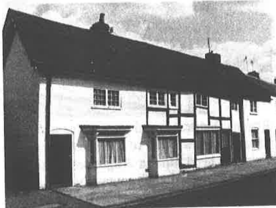
24-26 Church Street

(Bearman R: Stratford-upon-Avon: a history of its streets and buildings : Nelson: 1988-: 26).