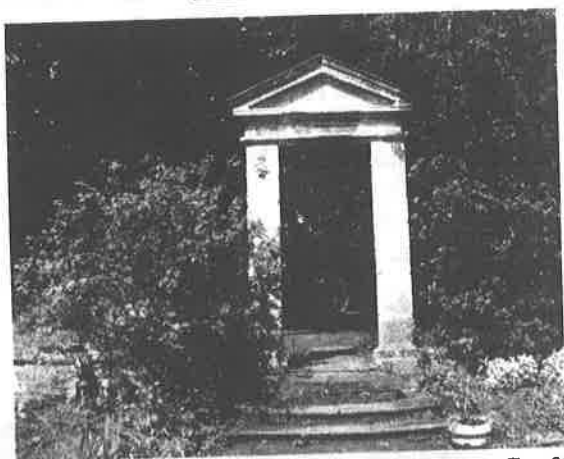
Gateway approx. 19m west of Mason Croft Church Street (Ref No. 54 - Grade II)

( Buildings of England : Pevsner N: Warwickshire : London: 1966-: 419; Bearman R: Stratford-upon-Avon: a history of its streets and buildings : Nelson: 1988-: 26-7).