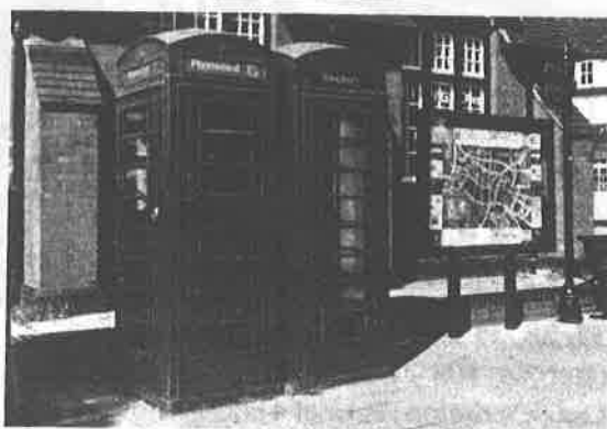
Two K6 Telephone Kiosks in front of St. Gregory's Centre (not included)

(Victoria County History (offprint): Styles P: The Borough of Stratford-upon-Avon and the Parish of Alveston : London: 1946-: 15; Fogg N: Stratford-upon-Avon: Portrait of a Town : Chichester: 1986 -: 104-6, 119, 133, 145; Buildings of England : Pevsner N: Warwickshire : London: 1966 : 417; Bearman R: Stratford-upon-Avon: a history of its streets and buildings : Nelson: 1988-: 37).