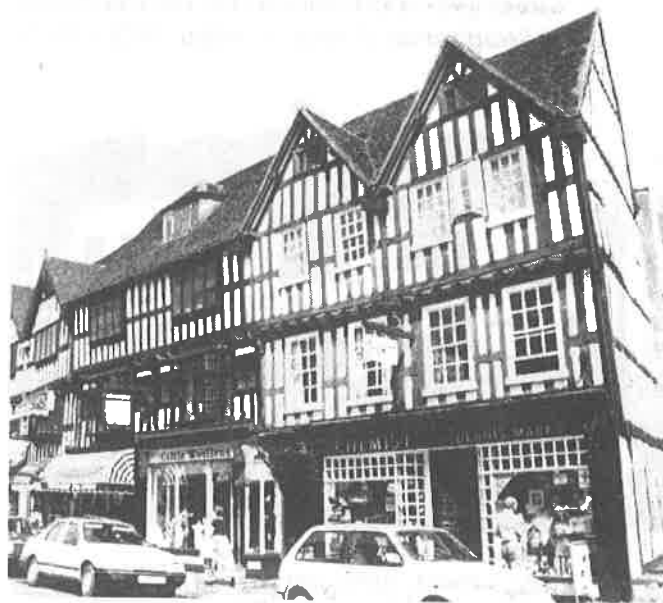
19 and 20 High Street (photo above, left; also page 49)

(Bearman R: Stratford-upon-Avon: a history of its streets and buildings : Nelson: 1988-: 40; History of the Streets of Stratford-upon-Avon : Bearman R and evening class members: High Street : 1971-1974).