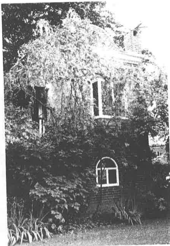
Gazebo approx. 42m west of Mason Croft Church Street (Ref No. 55 - Grade II)

( Buildings of England : Pevsner N: Warwickshire : Harmondsworth: 1966-: 419).