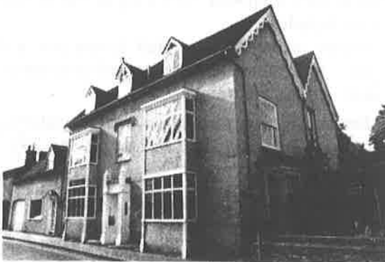
26 Ely Street Christian Science Reading Room (Ref No. 76 - Grade II)

(Bearman R: Stratford-upon-Avon: a history of its streets and buildings : Nelson: 1988-: 29).