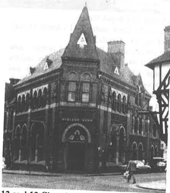
12 and 13 Chapel Street Midland Bank

(Bearman R: Stratford-upon-Avon: a history of its streets and buildings : Nelson: 1988-: 22).