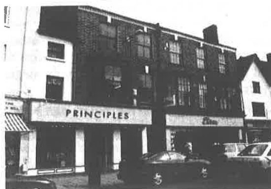
10-13 High Street

(Information from Shakespeare Birthplace Trust Record Office).