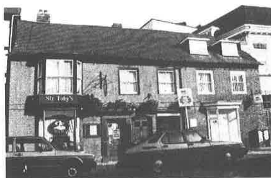
8 and 9 Church Street (Ref No. 42 - Grade II)

(Bearman R: Stratford-upon-Avon: a history of its streets and buildings : Nelson: 1988-: 26).