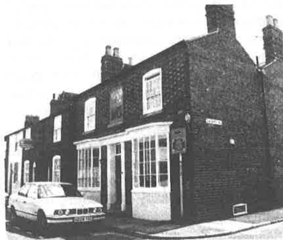
36 College Lane (Ref No. 59 - Grade II)

(Bearman R: Stratford-upon-Avon: a history of its streets and buildings : Nelson: 1988-: 66)