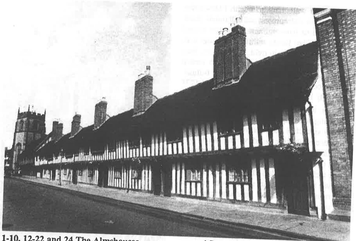
1-10, 12-22 and 24 The Almshouses Church Street (photo page 55) [Formerly listed as 1-11 Church Street, The Almshouses] (Ref No. 56 - Grade I)

List description : Row of 22 almshouses with one attached to rear. 1427-8, bay to left end (No 1) slightly earlier; much altered in C16; restored 1892; restored, modernised and extended to rear 1982-4 by Badger, Harrison and Cross. For the Guild of the Holy Trinity. Timber frame with plaster infill on renewed ashlar plinth; tile roof with five C16 brick stacks to front of ridge. 2 storeys; 21-window range. 1st floor jettied on joist ends. Central Tudor-headed entrance with enriched spandrels and paired doors, blocked entrance to left; 7 triangular-headed entrances in 2 pairs to either side and single one to end; all with renewed plank doors, that to No 1 with moulded architrave with mason's mitres. Windows mostly of 3 lights with leaded glazing, in pairs between doors; shallow 4+4-light oriels over central entrance and flanking pair of entrances; No 1 has 3+3+3-light window to