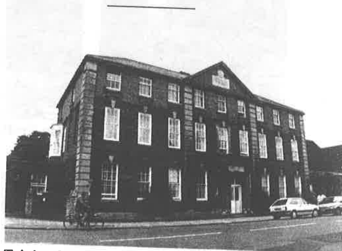
Trinity College Church Street (Ref No. 57 - Grade II)