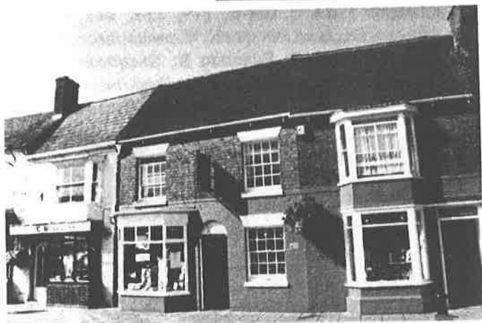
37, 38, 39 and 40 Henley Street (Ref No. 108 - Grade II)

(Bearman R: Stratford-upon-Avon: a history of its streets and buildings : Nelson: 1988-: 37).