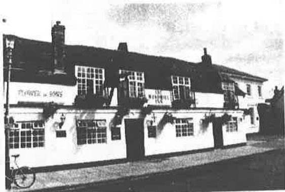
21 and 22 Church Street Windmill Inn

(Bearman R: Stratford-upon-Avon: a history of its streets and buildings : Nelson: 1988-: 26).