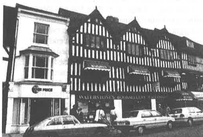
16 High Street (photo above, left; also page 49) (Ref No. 117 - Grade II)

(Bearman R: Stratford-upon-Avon: a history of its streets and buildings : Nelson: 1988-: 40).