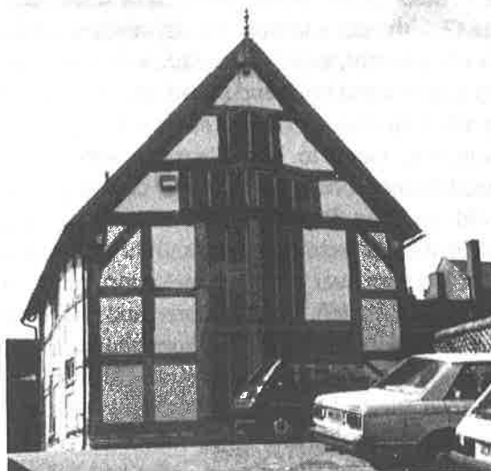
35 and 36 Guild Street (Ref No. 98 - Grade II)

(Bearman R: Stratford-upon-Avon: a history of its streets and buildings : Nelson: 1988-: 34).