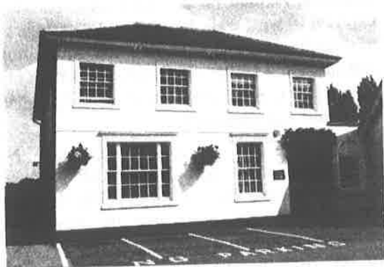
23 Church Street Winton House

(Bearman R: Stratford-upon-Avon: a history of its streets and buildings : Nelson: 1988-: 25).