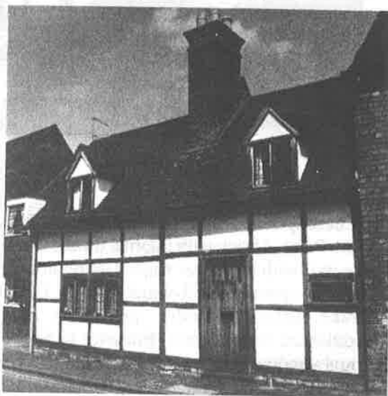
39 and 40 Ely Street (Ref No. 78 - Grade II)

(Bearman R: Stratford-upon-Avon: a history of its streets and buildings : Nelson: 1988-: 29).