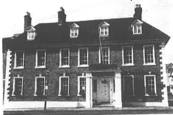
1 Church Street (photo also page 61) Stratford Preparatory School

[Formerly listed as The Croft School, including 1 Old Town]