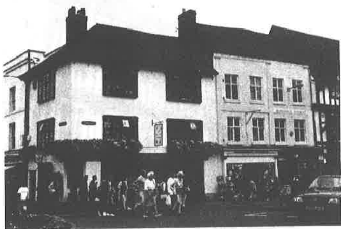
2 and 3 High Street

(Bearman R: Stratford-upon-Avon: a history of its streets and buildings : Nelson: 1988-: 41; History of the Streets of Stratford-upon-Avon : Bearman R and evening class members: High Street : 1971-1974; Forrest HE: The Old Houses of Stratford-upon-Avon : London: 1925-: 61-2).