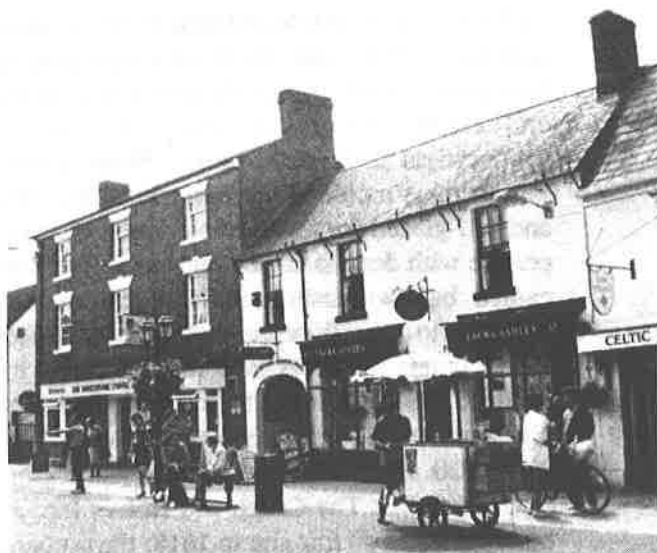
41 and 42 Henley Street (photo above, right) (Ref No. 109 - Grade II)

Interior: exposed chamfered beams; No 39 has exposed close-studded cross wall with tension braces and no infill, close-studded former rear wall and flat joists; 2 console brackets to RSJ. (Bearman R: Stratford-upon-Avon: a history of its streets and buildings : Nelson: 1988-: 37).