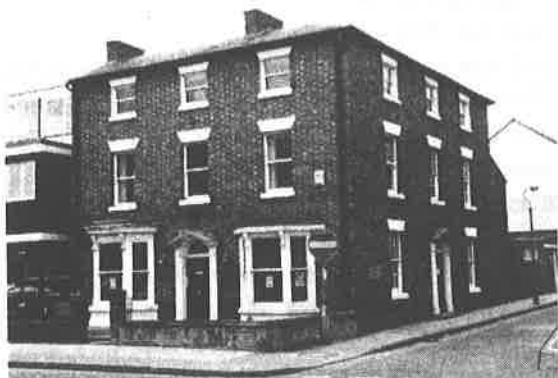
16 Guild Street (Ref No. 96 - Grade II)

(Bearman R: Stratford-upon-Avon: a history of its streets and buildings : Nelson: 1988-: 65).