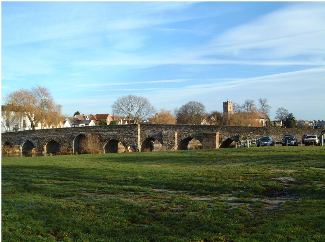
Bidford Bridge – Scheduled Ancient Monument