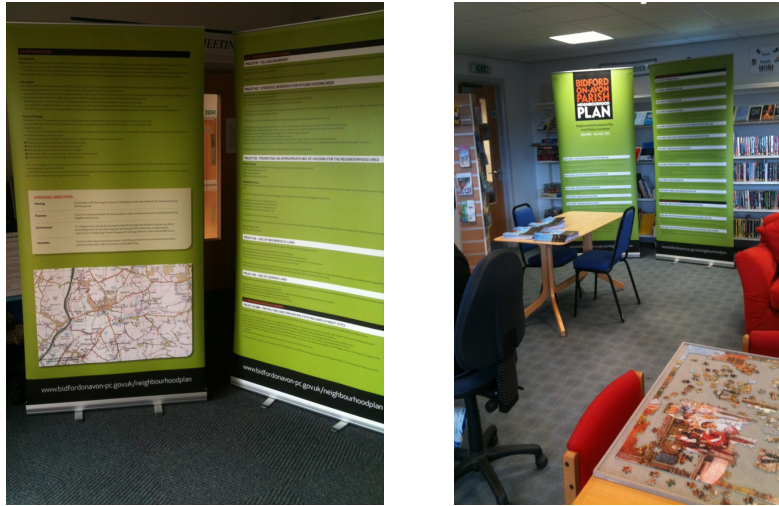
Draft Policies Consultation permanent display 26 th May to 6 th July 2015

The Steering Group reviewed the Pre-submission Consultation document on 15 th Aug. 2015 making the necessary amendments following the local community consultation.