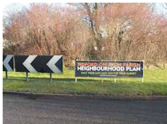
Publicising the NDP Parish Survey Dec. 2014