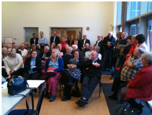
Launching NDP Event April 2014

The Bidford Neighbourhood Development Plan is the result of three years by the Bidford Neighbourhood Steering Group supported by Bidford-on-Avon Parish Council and the local residents and businesses.