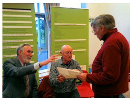
Parish Assembly – April 2015