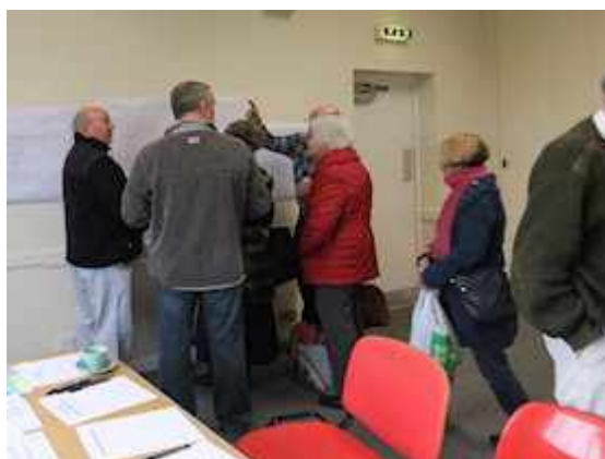
Raising awareness event

Bidford-on-Avon Parish Council and Bidford Neighbourhood Plan Steering Group have consulted with both its local community and the statutory bodies when preparing its NDP.