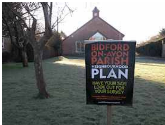
Publicising the NDP Parish Survey Dec. 2014