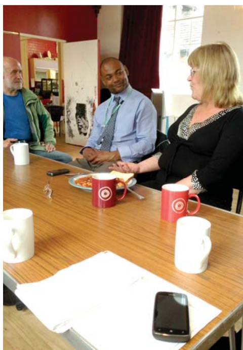
Group working through The Stratford Link Project

The partnership that prepared this Statement consists of several organisations operating within and beyond Stratford-on-Avon district and each brings with them different expertise. These include knowledge of the most socially and financially excluded, an understanding of the local voluntary sector, financial resources, human resources, expertise on the rural dimension and the challenges faced by migrants to the district and other minority communities.