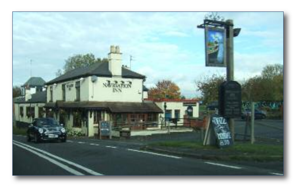
'I would like more of the community to use our pubs and clubs so that these local businesses can remain economically viable.'

Residents are loyal customers of local amenities. 22% use local shops at least once a week and 47% more frequently. Only 44% use the local post office regularly but this may be due to the decline in counter services and rise of the internet. Two-thirds drop into the local pubs and clubs but only occasionally, perhaps as a result of changing social habits.