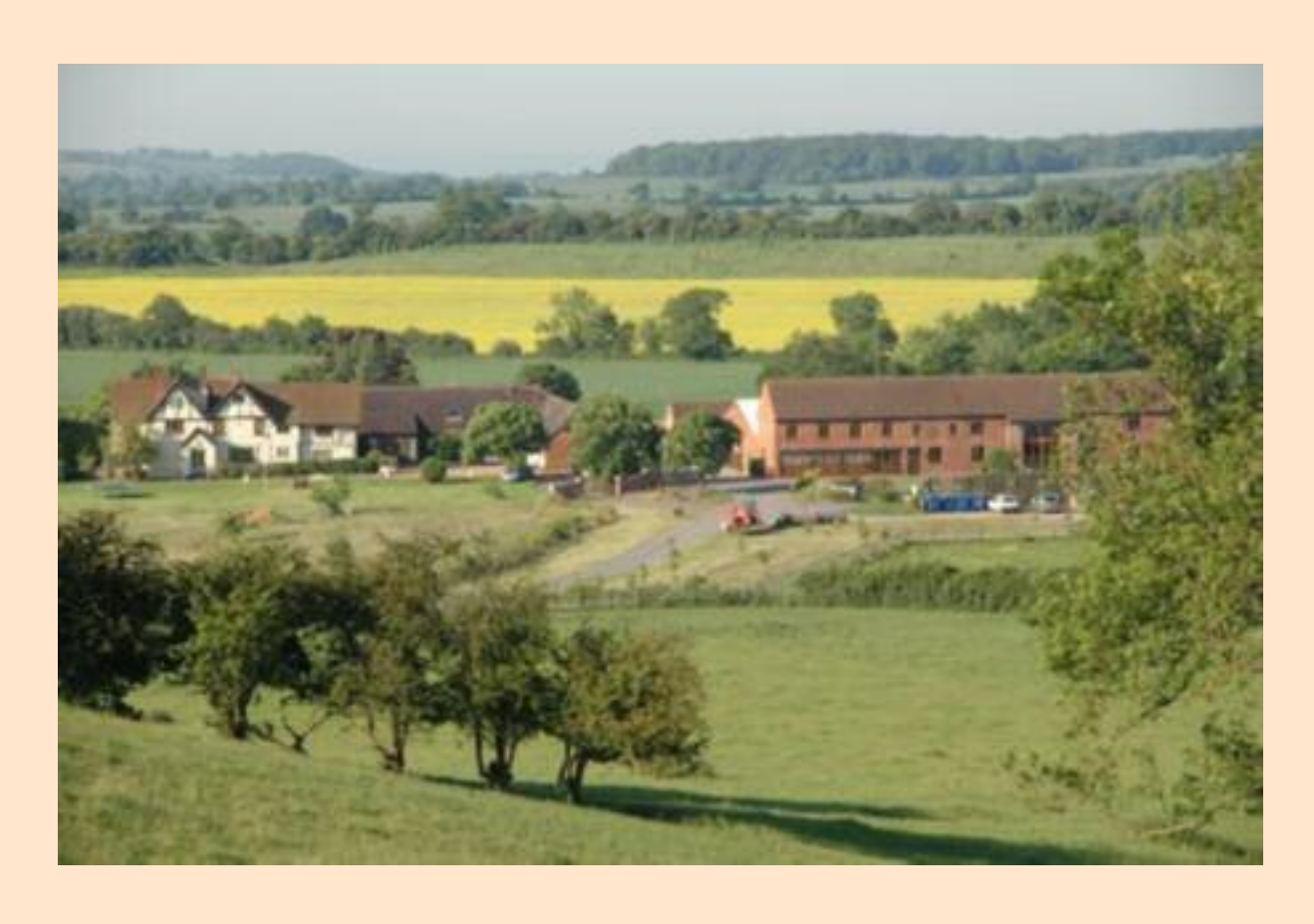
Twenty-first century diversification: agriculture, commerce and residence at Wootton Park Farm & Business Centre, Wootton Wawen