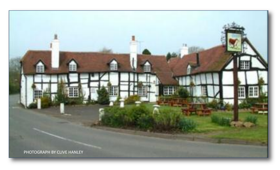
'The Bull should be the centre of village life alongside churches and schools.'

The number of businesses replying to this survey represents a positive response. It is encouraging to note that a third of these are willing to participate in ongoing dialogue with regard to the future of Wootton Wawen. This could generate the opportunity for more widespread consultation over issues such as development, equally for preservation or for change. It also offers a platform for business, parish and regional authorities to move to a better understanding of each other's viewpoint and foster closer working relationships.