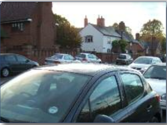
'[Bus stop] could be made longer to allow for bus and cars as there is more than enough room.'