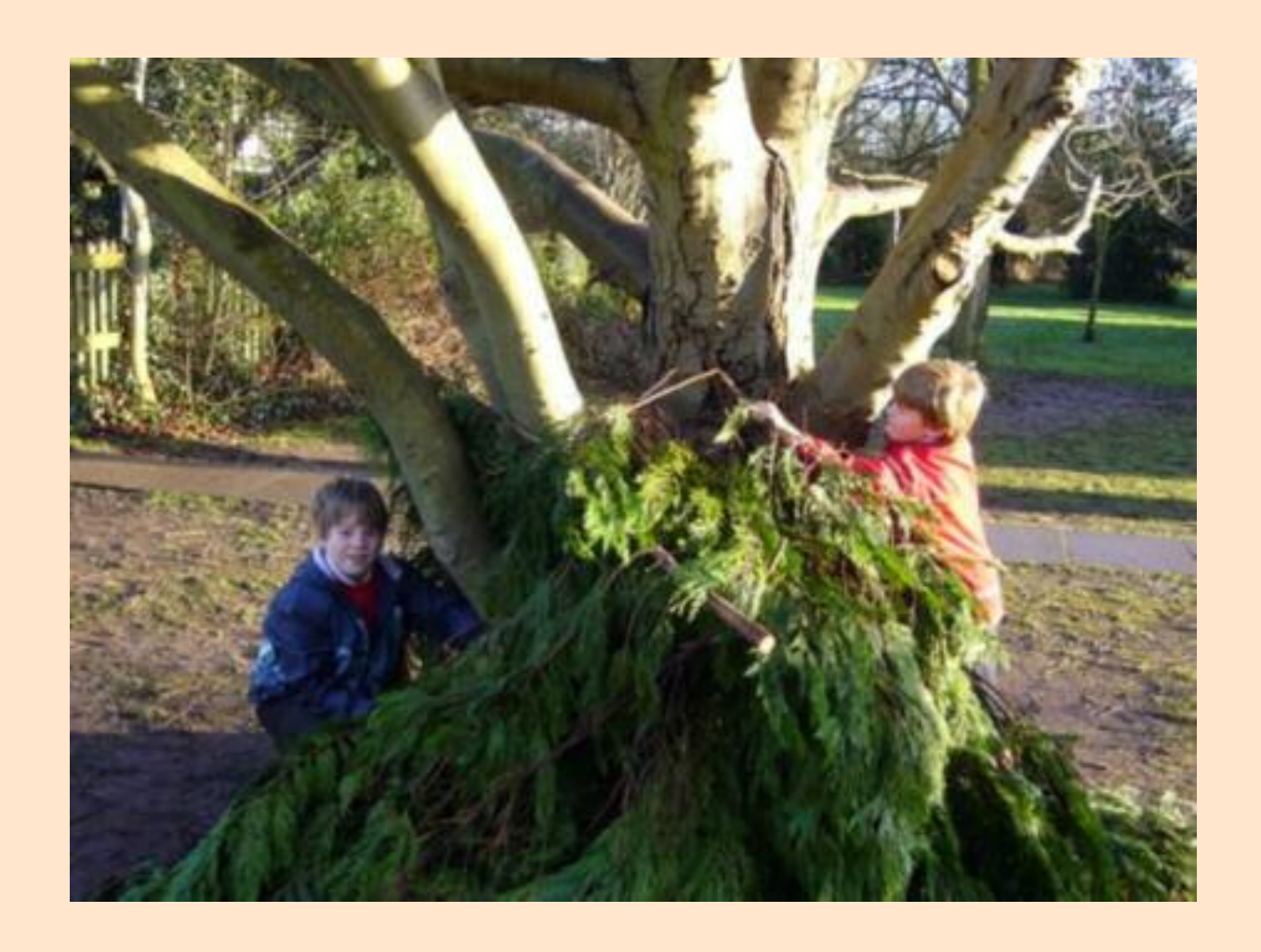
Wootton Wawen Parish Council 2010