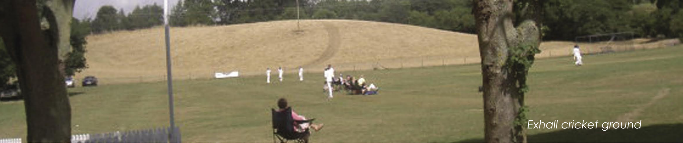
Exhall cricket ground

for further information ideas, comments and offers of assistance: