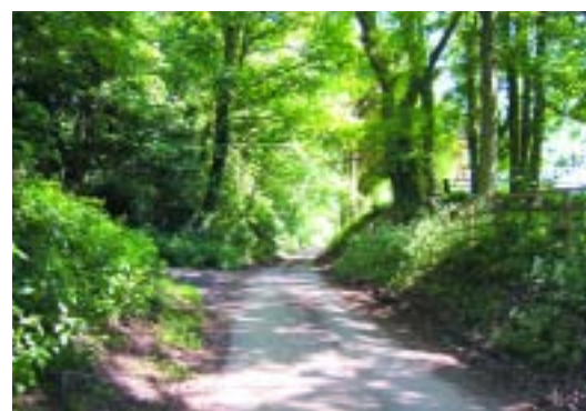
Approach from Keys lane