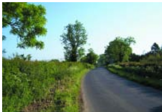
Approach from Napton & Shuckburgh