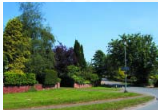
The Green from Southam Road

In addition to the vistas shown in Section 2 hereof, Priors Marston particularly wishes to retain the following additional vistas.