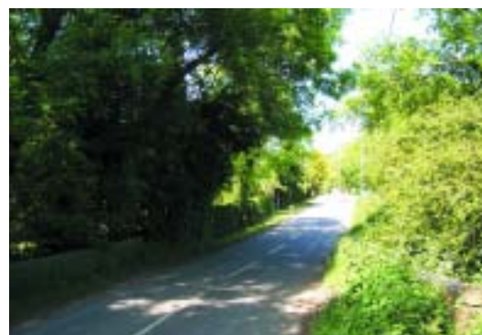
Approach from Priors Hardwick