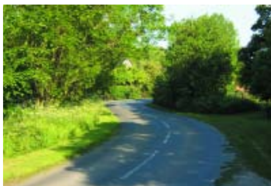
Approach from Byfield