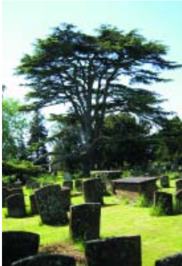
Cedar of Lebanon

The most notable landscape feature of Priors Marston has to be the Churchyard which contains two magnificent Cedars of Lebanon, mature Yews, mature