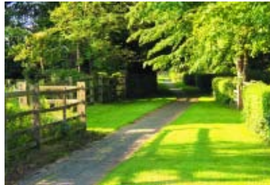
Blue brick footpath

Drovers Road enters the Parish, and running north to south forms the boundary with Priors Hardwick. It was used for several hundred years prior to the railways to drive livestock from the Welsh farms and others on route to the London markets. The main coaching route from Warwick to London ran through the village on its way to Towcester and was such an important link a High Constable was stationed here to deter highwaymen. The Oxford-Coventry canal opened in 1778.