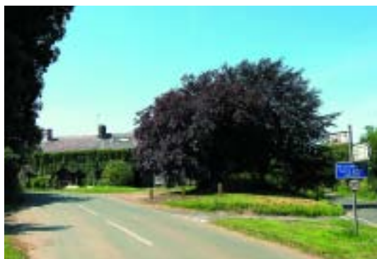
Approach from Southam

The other three approaches from Napton and Shuckburgh; from Priors Hardwick and the alternative approach from Hellidon through Keys Lane are much quieter.