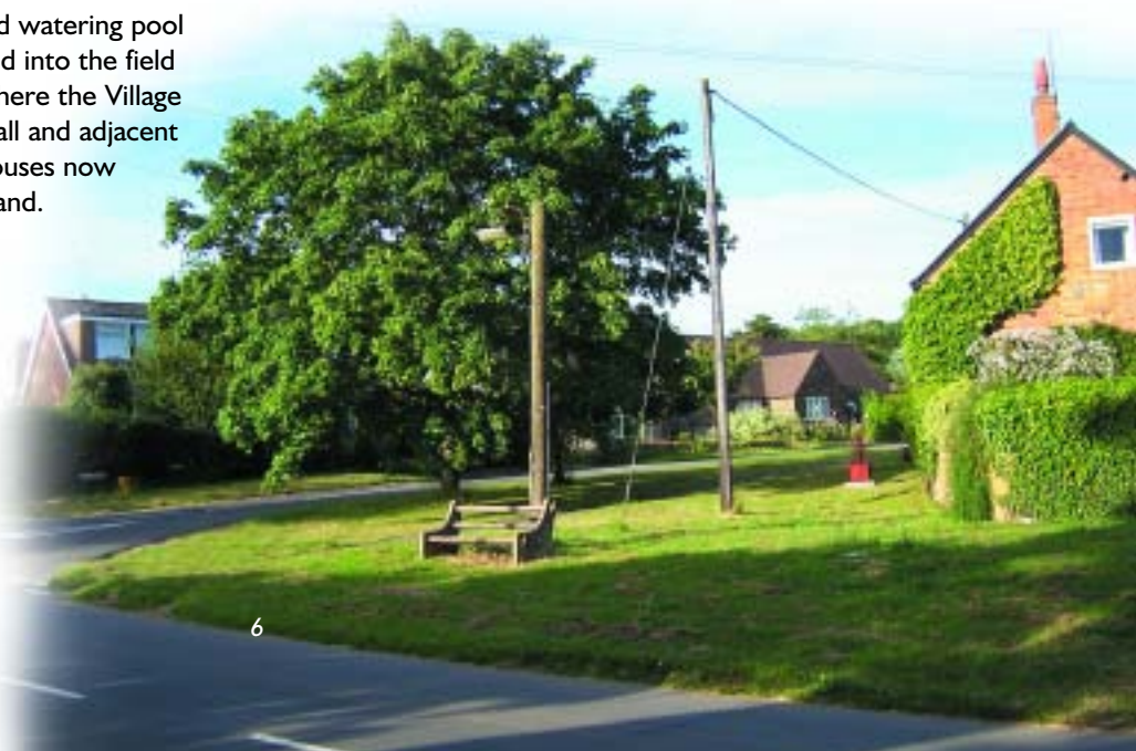
The Middle Green

As the village developed further south, another open space or Green was established running from where the telephone box now stands to the east as far as Westwood House, back to the churchyard wall to the north side where the remnants of the Village Pound still exist. This was where stray livestock would be kept until claimed by the owners who would have to pay a fine. Up to about a hundred years ago, village workshops and a smithy stood where the Holly Bush Inn car park is now situated. It is possible that the earliest school was also on this site, all facing onto this Middle Green.