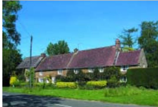
The Northern Green

This (Northern) Green was part of all this and extended to the east up Keys Lane and Vicarage Lane, linking to the churchyard in front of The Orchard. It is generally recognised that, with the earlier greens, the Church is always very close. On a Spencer Estate plan of about 1750, this is shown as 'the Common'.