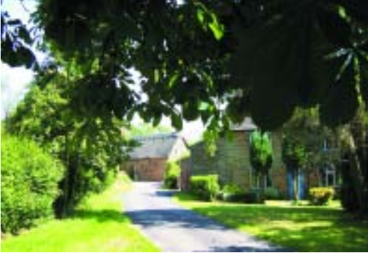
School Lane towards the Old Manor

The buildings in the village comprise a wide variety of styles and materials, all of which combine to give it a special character. As most of the village is designated as a Conservation Area, the design requirements are necessarily more stringent than elsewhere and therefore, developments within that area will be expected to enhance and improve the area.