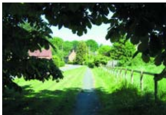
Footpath Vicarage Lane

The Field footpath and Bridleway network we have today has been established for several hundred years and was originally brought into use to get to places of work and adjacent villages. In turn, the paths linked to others to get further afield. They often are a shorter, more direct route than the Highways, and they take one through some interesting countryside. The Paths and Bridleways are mainly used for recreational purposes today and are surveyed, maintained and signposted by a small team of Parish volunteers in conjunction with the County Council Parish Partnership Scheme. Larger works are carried out by the County Council, as is the maintenance of the Village footpaths with tarmac and brick surfaces.