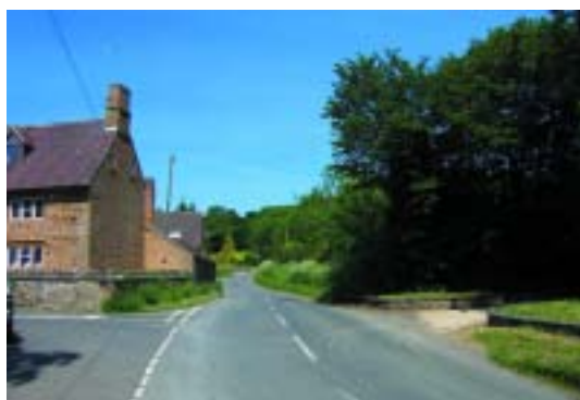
Approach from Hellidon

As a consequence the northeastern and central parts of the village being comparatively quiet with less traffic movement.