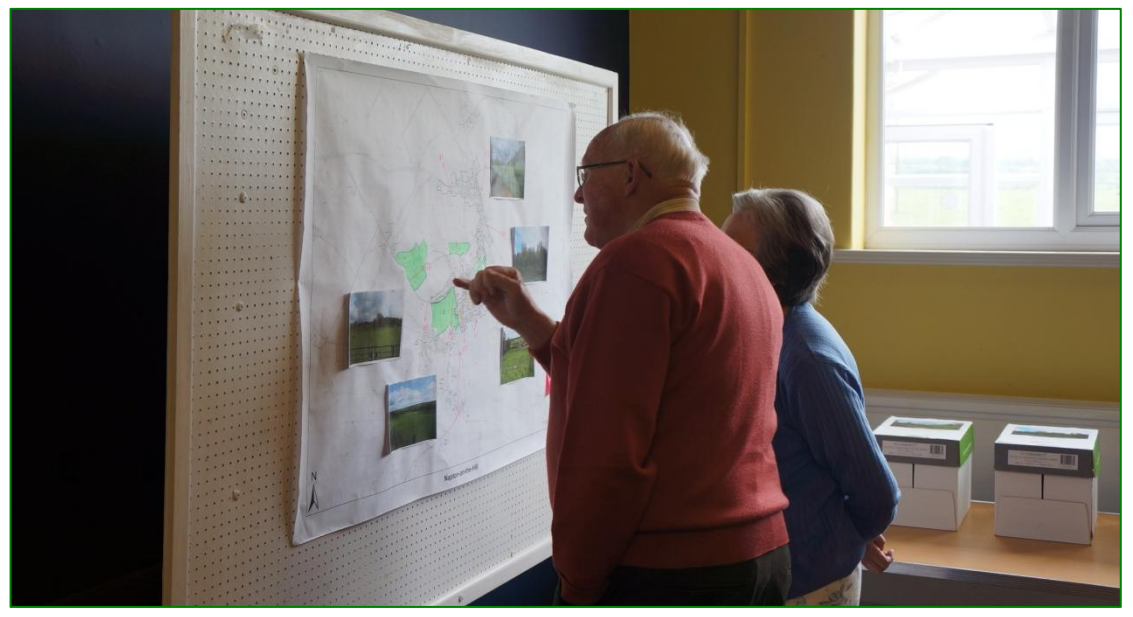
Consultation on potential Local Green Spaces and important views

3.10 At the Annual Parish Meeting in May 2018 members of the Steering Group displayed maps indicating potential sites for Local Green Space designation and associated material. They also showed the possible location of important views worthy of protection. The exhibition was attended by 55 people, many of whom made comment to the Steering Group representatives.