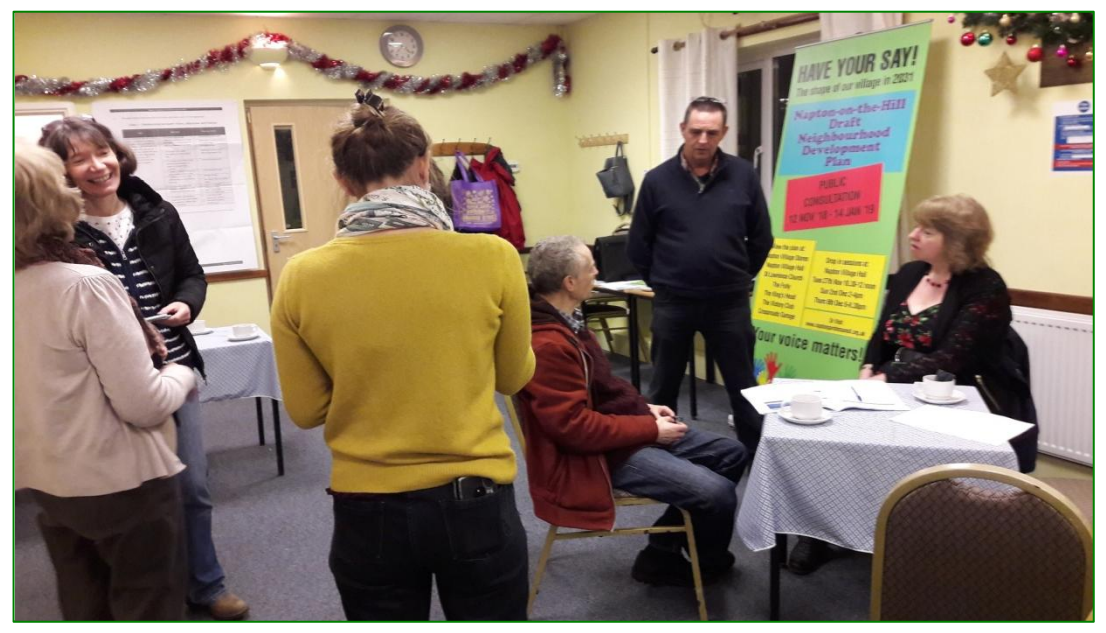
A drop-in session hosted by members of the Steering Group